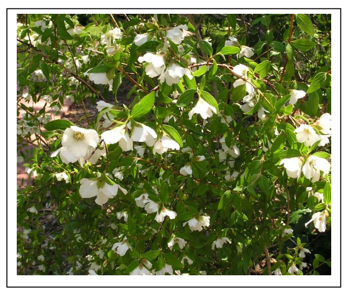
Philadelphus microphyllus, Laramie County (cultivated)

Philadelphus microphyllus, Desert Mock-orange, is a slow growing deciduous shrub to 4 or rarely 6 feet tall and 5 feet wide. The leaves are opposite, narrow, and to 1 inch long. The flowers are white, usually fragrant, 0.5 to 1 inch across, and 1 to 3 at the branch tips. It can bloom from May to September depending on moisture availability. The plants occur naturally on cliffs and rocky slopes in the plains and basins.