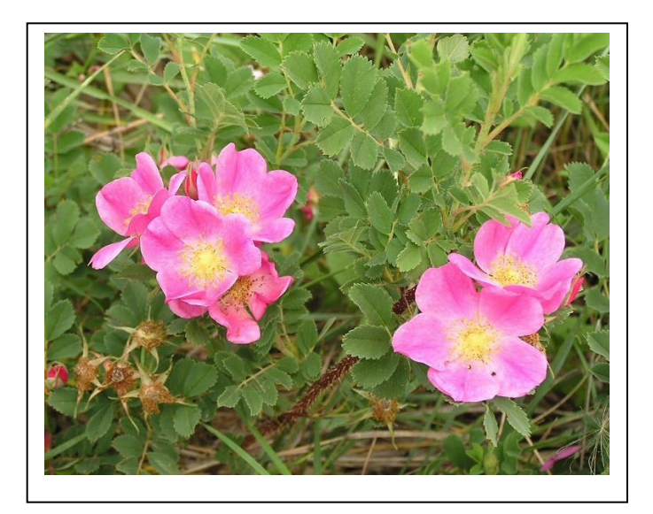
Rosa arkansana, Custer County, South Dakota

They prefer full sun and well drained soils and are drought tolerant. They will not bloom during drought and will do best with an occasional deep watering in spring. It is easily grown from seed barely covered with soil to allow some light exposure. Cold stratification for 60 days helps germination. It can also be grown from greenwood or semiripe wood cuttings. It is in the nursery trade with several cultivars.