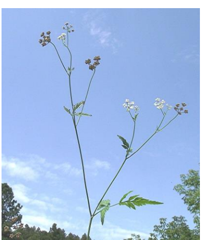
Above: Torilis japonica

To see the above plants in color, go to the newsletter on the Society website.