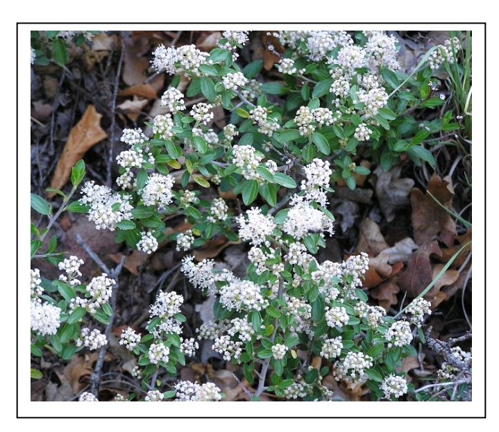
Ceanothus fendleri, Mora County, New Mexico

Ceanothus fendleri, Fendler Ceanothus, is a deciduous shrub to 2 feet tall and 8 feet wide with thorny stems. The leaves are somewhat small, to 1.25 inches long and 0.5 inch wide. The flowers are white, tiny, and in small clusters at the ends of branches with many clusters covering a bush. They appear from June to August. The fruit is a capsule which becomes dull red when mature. The plants occur naturally in moist to dryish open woods or open areas in the mountains and foothills. They prefer full sun to light shade and dryish, well drained soils. They are drought and alkali tolerant. They should not be given extra water to avoid root rot. They can be grown from greenwood or semiripe wood cuttings or from seed surface sown outdoors in fall. It is also in the nursery trade.