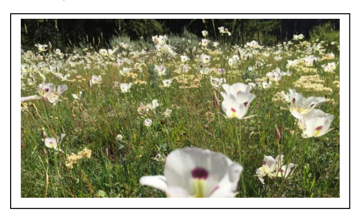
...What's in a common name? Consider the Calochortus genus – is it Mariposa lily? Sego lily? Star tulip?

Below: -More mariposa magic! Calochortus eurycarpus (white mariposa lily) flowering profusely in the Green River Basin, by Julie Kraft, 2017.