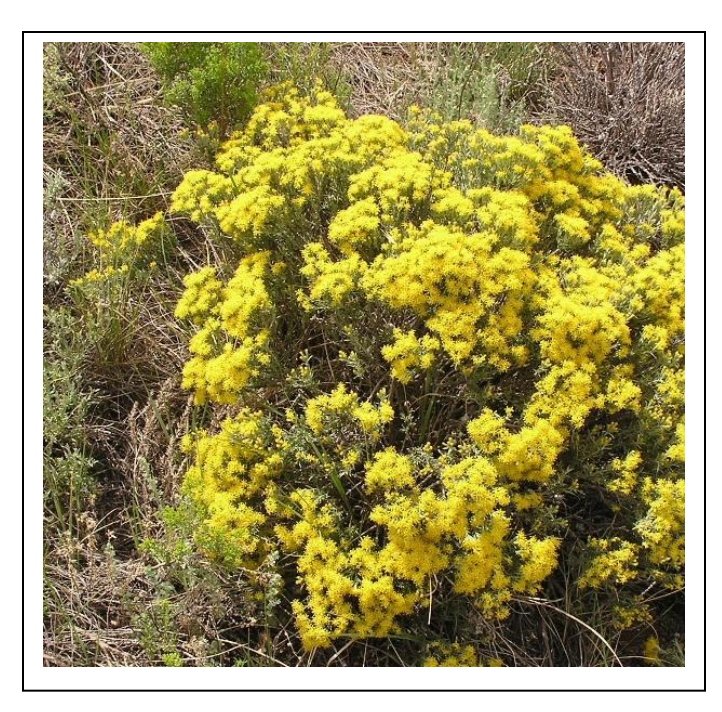
Tetradymia canescens, Park County, Colorado

Tetradymia canescens, Common Horsebrush, is a bushy shrub to 2.5 feet tall and as wide. The leaves are narrow, to 1.2 inches long, and usually grayish-white from dense hairs. The flowers are yellow in small heads that are densely clustered at the ends of branches and appear from June to September. The plants occur naturally in dry open places in the plains, basins, and mountains. They prefer full sun and dry to moist well drained soil. They are drought tolerant. They can be grown from seed sown outdoors in fall. Seed is commercially available.