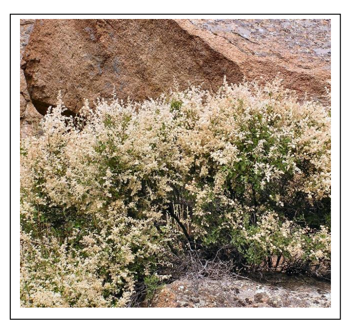
Holodiscus dumosus, Albany County

be grown from semiripe wood cuttings or from seed that has been cold stratified for 130 days.