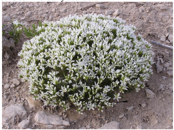
Eremogone hookeri, Goshen County

from fresh seed but germination may be low. Seed is commercially available.