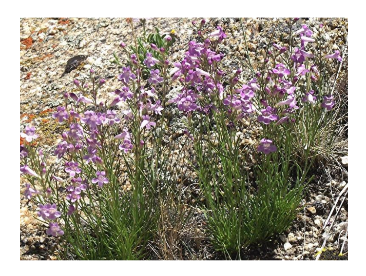
Penstemon laricifolius, Sweetwater Co.

Penstemon laricifolius, Larchleaf Penstemon, is a perennial to 8 inches tall and forming loose mats to 1 foot across. The leaves are very narrow and less than 1 inch long. The flowers are from white to pink or lavender, to .75 inch long, and in small clusters scattered along the upper half of the stems. They appear in June and July. The plants occur naturally on dry, rocky, open places, often on limestone, in the plains, basins, and mountains. They prefer full sun and dry, well drained soils. They can be grown from seed sown outdoors in the fall or cold stratify for 30 days or more for spring seeding. Seed is commercially available.