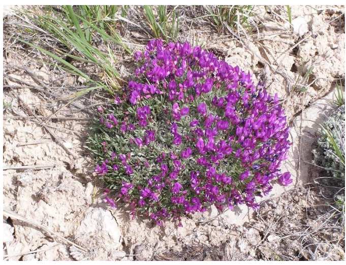
Astragalus spatulatus, Goshen County

Astragalus spatulatus, Draba Milkvetch, is a mat forming perennial to 4 inches tall and 6 to 24 inches across, more densely matted in dryer areas of the western half of Wyoming. The leaves are mostly simple and narrow and up to 2.5 inches long but usually much less. The flower color can vary but is usually pink-purple with often cream colored wing tips, each flower up to .35 inch long and in clusters of 2 to 11 on short stems among the leaves. They appear from May to July. The plants occur naturally in open, often gravelly or rocky places in the plains, basins, and mountains. They prefer full sun and dry, well drained soils. They can be grown from seed which should be scarified before planting. Seed is commercially available.