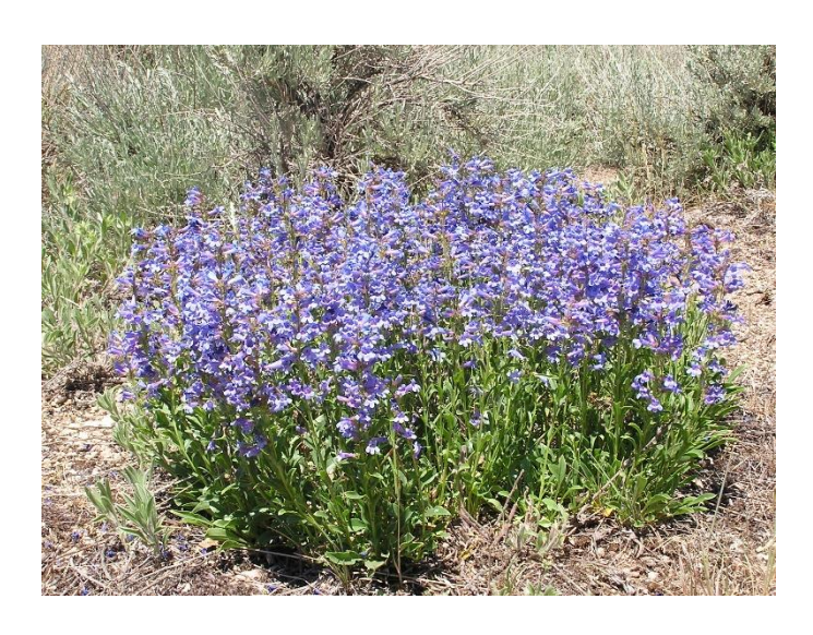
Penstemon virens, Converse Co.

Penstemon virens, Green Penstemon, is a perennial to 16 inches tall and somewhat mat forming. The leaves are to 2.5 inches long and rarely to 1 inch wide. The flowers are blue-purple, to .75 inch long, and scattered along the upper half of the stems. They appear from May to August depending on elevation. The plants occur naturally in rocky or gravelly places in the upper edge of the plains, the foothills, and mountains. They prefer full sun and dry, well drained soils. They can be grown from seed sown outdoors in the fall.