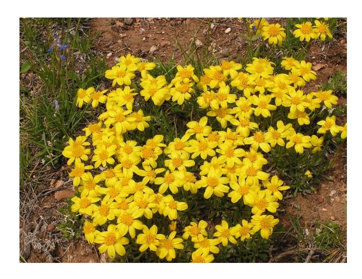
Stenotus acaulis, Uintah Co., UT

Stenotus acaulis, Stemless Goldenweed, is a perennial to 6 inches tall forming mats to several feet across. The leaves are narrow, to 2 inches long, and mostly basal. The flowers are yellow, the heads to 1.5 inches across, solitary at the stem tips, but often nearly covering the mat. They appear from May to July. The plants occur naturally in dry, open places in the plains, basins, and mountains. They prefer full sun and dry, well drained soils. They can be grown from seed which is commercially available.