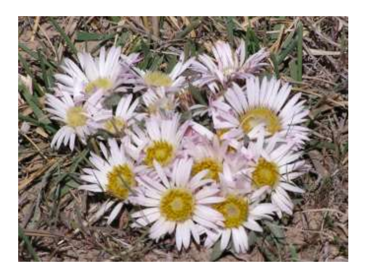
Townsendia exscapa, Goshen County

Townsendia exscapa , Stemless Daisy, is a perennial to 3 inches tall. The leaves are narrow and all basal. The flower heads are to 1.5 inches across and are sessile among the leaves with white or pinkish rays and yellow disk flowers and appear from April to June. The plants occur naturally in dry, open areas on the plains. They prefer full sun and dry to slightly moist soils. It is easy to grow from fresh seed covered lightly with soil.