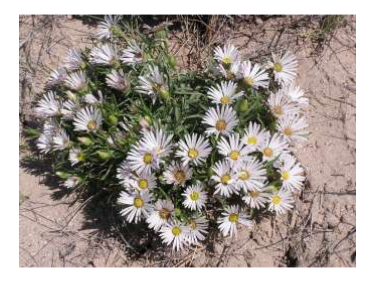
Townsendia grandiflora, Goshen County

Townsendia grandiflora , Largeflower Daisy, is a biennial or short-lived perennial to 8 inches tall and wide, somewhat sprawling, and usually with several stems. The leaves are narrow and to 3 inches long. The flowers are in heads to 1.75 inches across terminating the stems and branches, the rays white and the disk flowers yellow. They appear from April to July. The plants occur naturally in dry, open places on the plains. They prefer full sun and dry, well drained soils. It is easy to grow from seed lightly covered with soil. It is in the nursery trade.