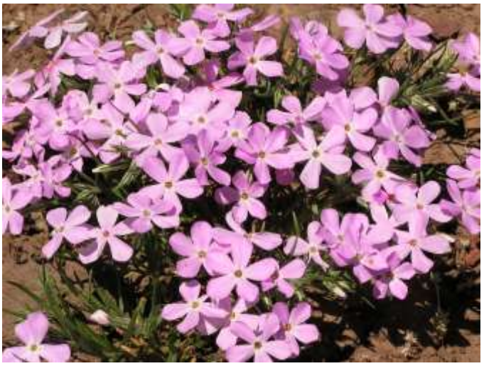
Phlox longifolia, Dolores County, CO

Phlox longifolia , Longleaf Phlox, is a perennial to 8 inches tall and 5 inches wide, rarely taller. The leaves are opposite, very narrow, and to 3.5 inches long. The flowers are light pink, lavender, or white, to 1 inch across, loosely clustered at tips of stems, and appear from April to July. The plants occur naturally in moist to dry, rocky places or in sand in the plains and basins. They prefer full sun and dry, well drained soils. They are drought tolerant. It can be grown from seed surface sown outdoors in the fall. It is also in the nursery trade.