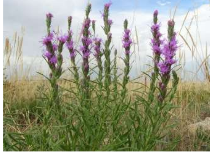
Liatris punctata, Albany County

They prefer full sun and tolerate many soils. They are drought tolerant. It can be easily grown from fresh seed barely covered with soil. They are difficult to transplant. It is in the nursery trade.