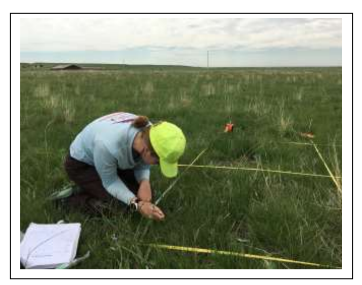
Above: Probing Colorado butterfly plant life history, by Alice Stears

Wyoming has had four species of plants protected under the Endangered Species Act (ESA) of 1973, ranging from the delicate Ute ladies'tresses (Spiranthes diluvialis) to the sand-dune blowout penstemon dwelling (Penstemon haydenii). But after December 5, 2019, the state is down to only three protected plant species (USFWS 2019). The Colorado butterfly plant (Oenothera coloradensis), which was listed as 'threatened' under the ESA in 2000, was removed from the Federal List of Endangered and Threatened Plants in 2019 due to recovery, and is "no longer likely to become endangered in the near future."1 From our human perspective, the protective status, and even the name of this perennial forb have changed a bit over the last several decades. But how have things changed from the plant's perspective?