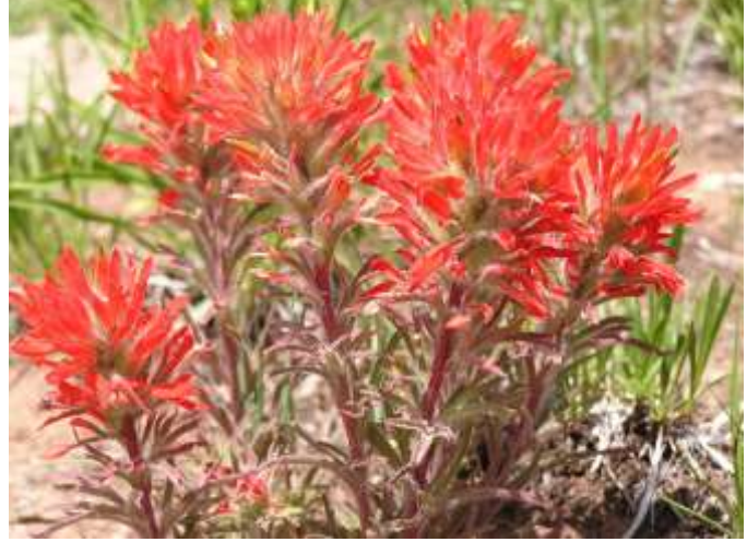
Castilleja angustifolia var. dubia, Uintah County, UT

Castilleja angustifolia, Narrowleaf Indianpaintbrush, is a perennial to 12 inches tall and half as wide, usually with several stems, and is parasitic on roots of nearby plants. The leaves are very narrow, to 2 inches long, and usually 3 lobed at the tip. The flowers are greenish and inconspicuous, mostly hidden among the large, usually orange, pink, or red bracts. The flowers appear from May to July but the bracts are showy for most of the summer. The plants occur naturally in open areas of the plains, basins, valleys, and mountains, often growing with sagebrush which is often the host plant. They prefer full sun and moist to dry, well drained soils. It can be grown from seed but must be grown with another plant, preferably Big Sagebrush or Rubber Rabbitbrush, which can serve as a host. Germination may be slow. Cold stratify for 30 days or more or plant outside in the fall. Surface sow to allow light exposure. Seed is commercially available. Variety dubia (Castilleja chromosa) is more attractive than var. angustifolia .