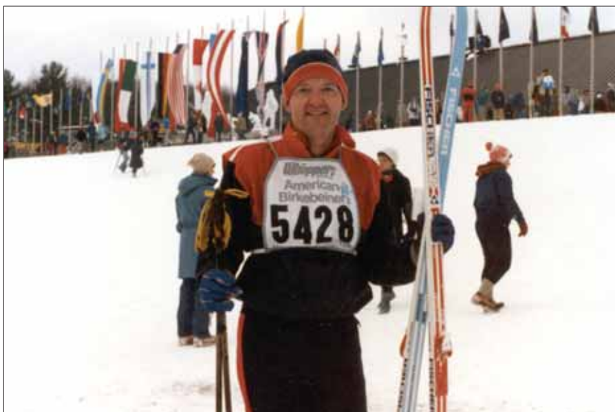
Getting ready to race in the Birkebeiner, a cross-country skiing trip that traverses 33 hilly miles in Wisconsin.

Hintz led his staff in compiling a study that analyzed whether Entergy's nuclear plants could survive. The quick answer was yes. If the plants were operated at high capacity factors and with controlled costs,