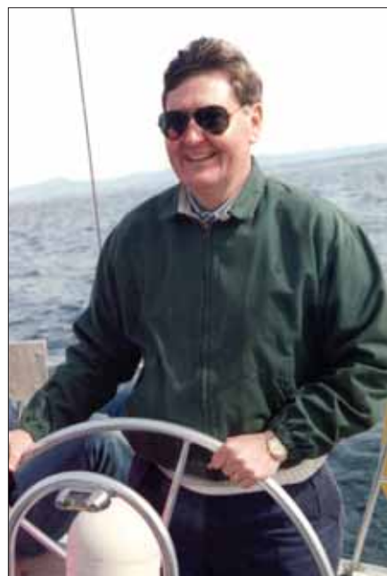
At the helm of a sailboat