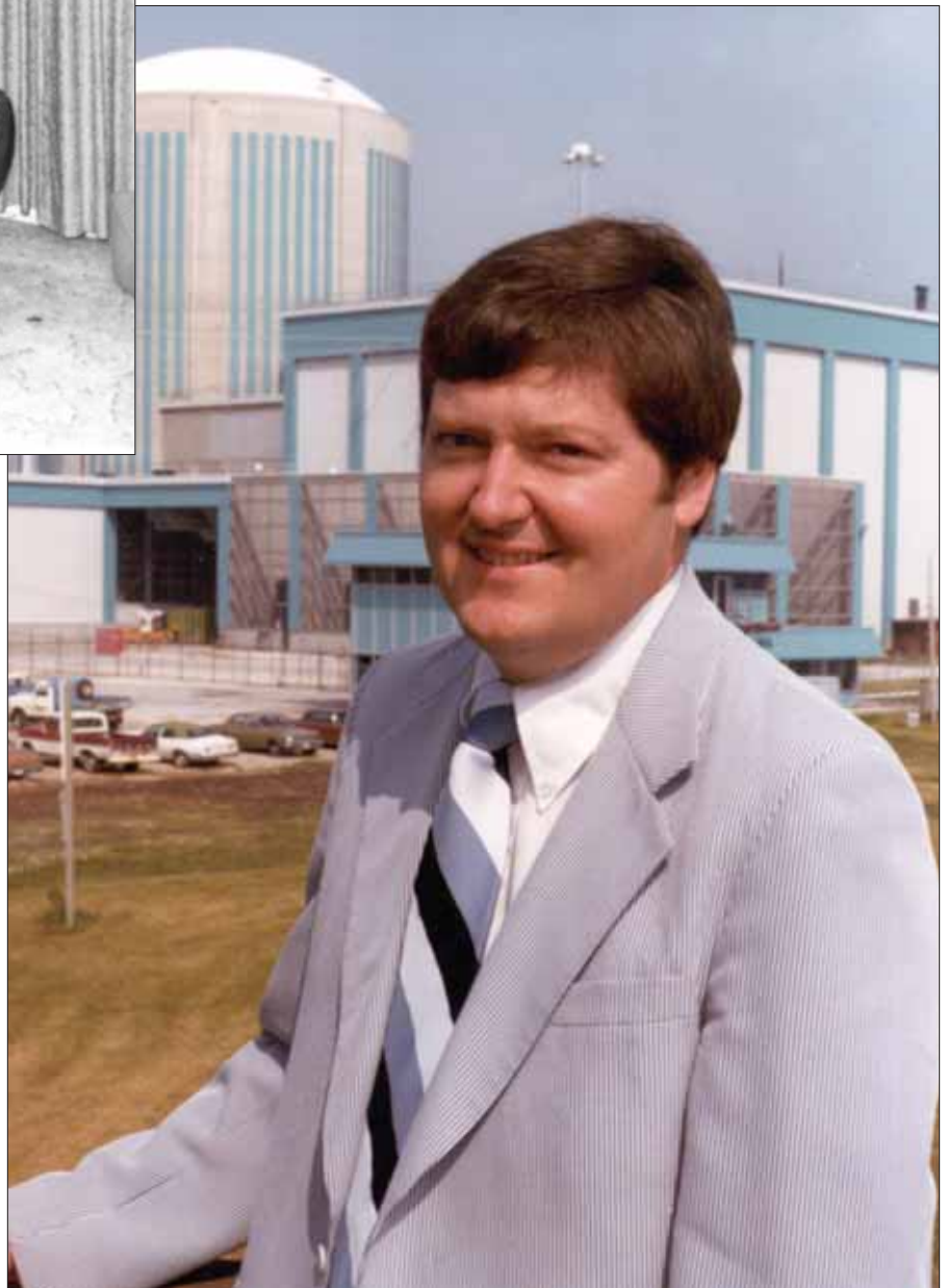
The new plant manager, with the Kewaunee nuclear power plant in the background