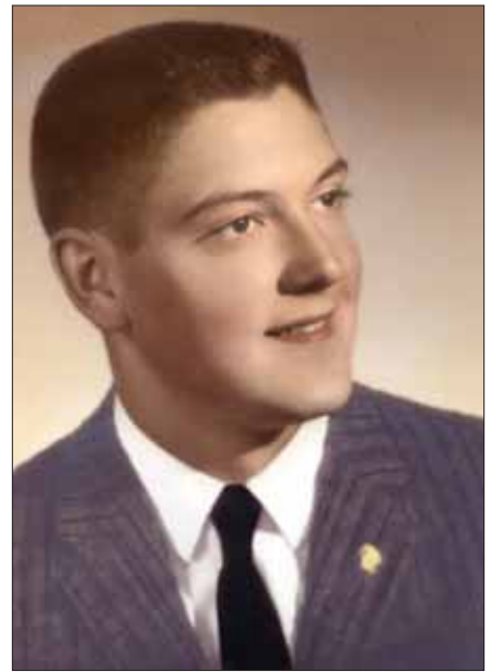
High school portrait