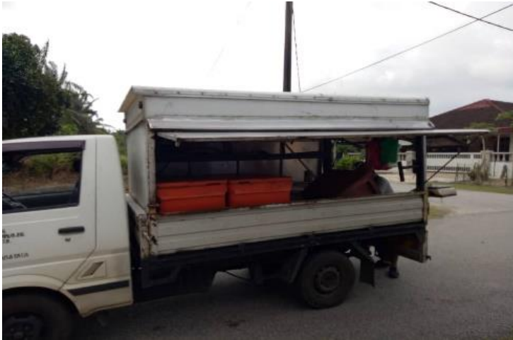
Figure 2: Villager who supplies meat and fish to the village

As there is are no wet markets or grocery stores in the village, villagers travel to nearby towns for shopping. Previously, most of the villagers planted vegetables for own use or to sell to other villagers. There is no meat or fish supply. Consequently, one of the villagers volunteered to supply meat and fish to the village. Every morning, he goes to another village known as Kampung Kerteh to buy an some quantities of meat and fish and he will then drive around Kampung Air Jernih between 3 pm to 4 pm. Villagers can make a prior booking with him or buy on the spot, which may have the problem of not having any more stocks available on that day.