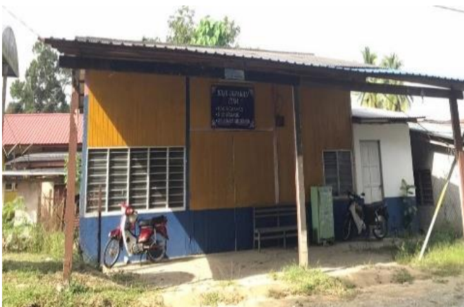
Figure 14: Previous fire station is now a Voting Station