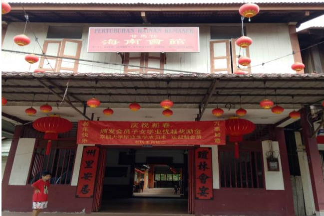
Figure 12: Persatuan Hainan Kemasek