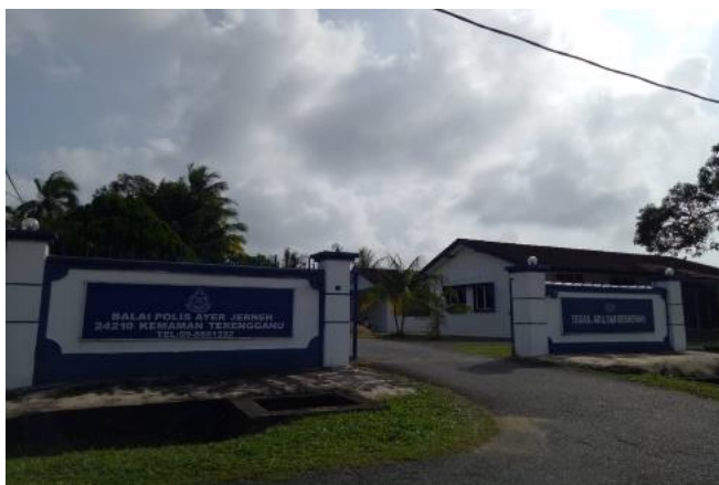
Figure 11: Balai Polis Ayer Jernih