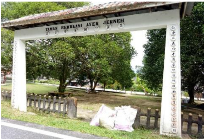
Figure 13: Taman Rekreasi Ayer Jerneh