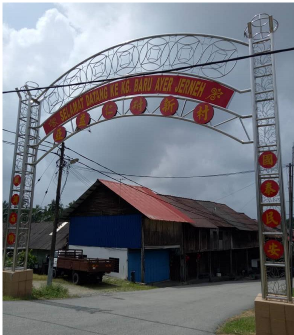
Figure 1: Pintu Gerbang Kampung

Kampung Air Jernih is located in Kemasik, Terengganu. It has over 100 years of history. The nearest town to the village is Kemaman, which is half an hour away. Currently, its total population is around 700 to 800, which includes 300 to 400 villagers still living in the village and the youths who have left. When the village was founded, it had over 6,000 villagers, but over the years the population declined. The village was founded by Hainanese migrants from Hainan, China to Terengganu; therefore, most of the villagers are Hainanese.