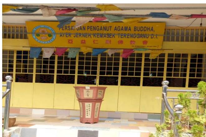
Figure 5: Persatuan Penganut Agama Buddha