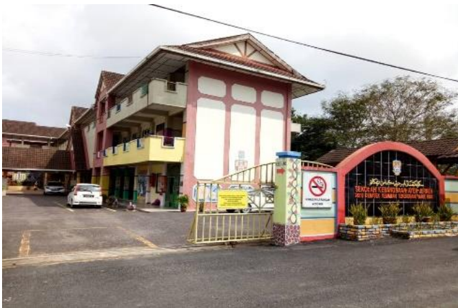
Figure 7: Sekolah Kebangsaan Ayer Jerneh

The annual enrolment of students in SJK(C) Lok Khoon is 48. It is considered a miniature Chinese primary school. The total number of teachers in the school including the headmaster is only 11.