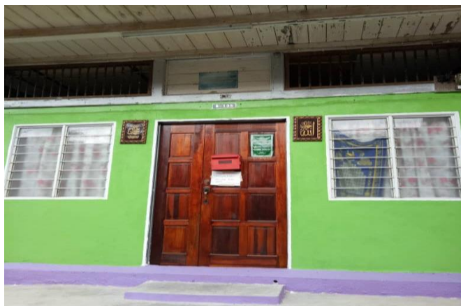
Figure 4: Islamic