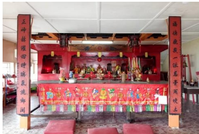
Figure 3: Tian Hou Gong

The main festival celebrated is October 15 th of the lunar calendar. An invitation will be extended to a monk from Thailand and a parade will be held. Some performers from Singapore will also be invited to give a Hainanese performance. Other than that, they also celebrate Chinese New Year. These are the two festivals in which most of the youths come back to the village to celebrate with family members.