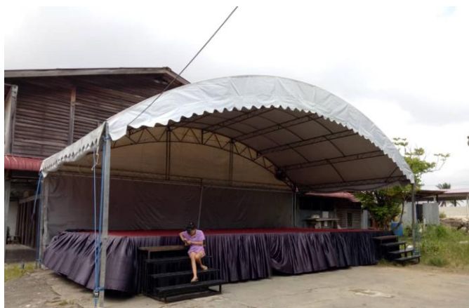
Figure 6: Stage for festival performance