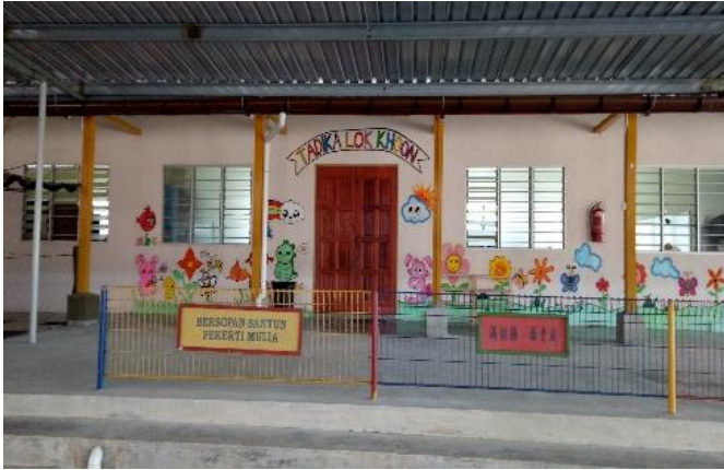
Figure 9: Tadika Lok Khoon