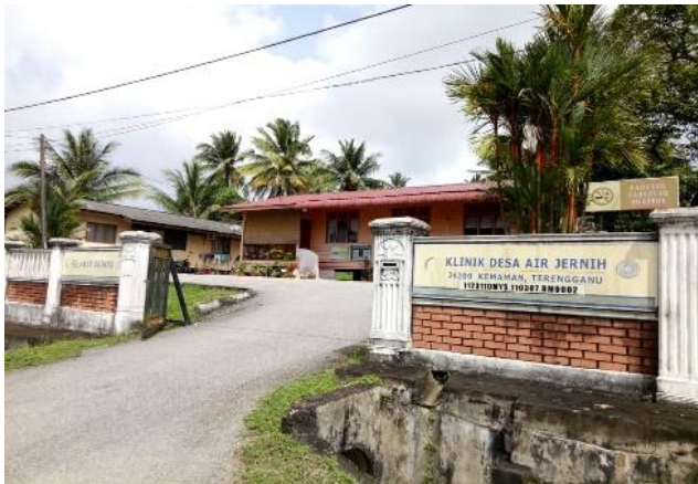
Figure 10: Klinik Desa Air Jernih

Garbage collection in Kampung Ayer Jernih is adequate. A rubbish truck collects the rubbish from every household each day.