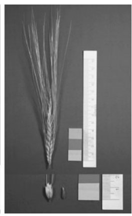
Fig. 1 Spikes (above) and spikelets and grains (below) of different subspecies (and origins) of Triticum dicoccon. From left to right: ssp. abyssinicum (Ethiopia, Yemen, India),