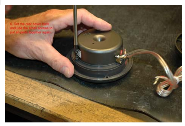
6. Reinstall the rear chamber and use the screws to put all parts together again.