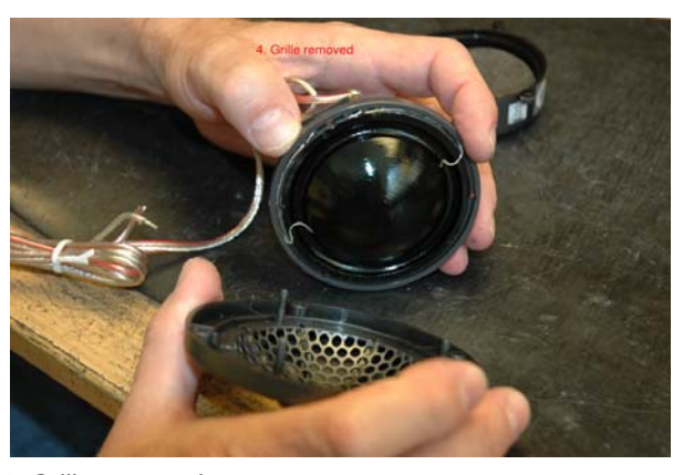
4. Grille removed.