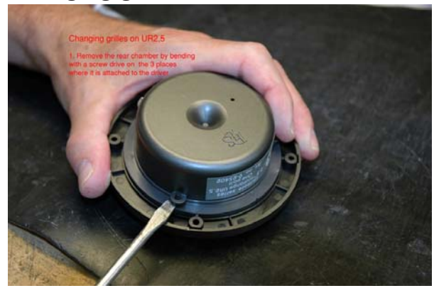
1. Remove the rear chamber by bending with a screwdriver on the three spots where it is attached to the driver. Be careful!