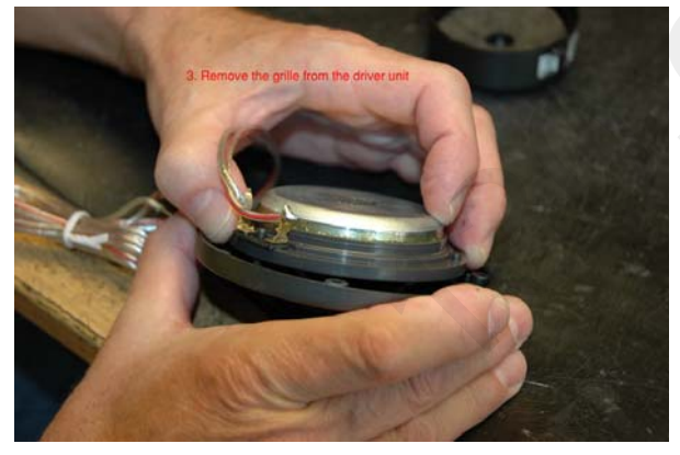
3. Remove the grille from the driver unit like this.