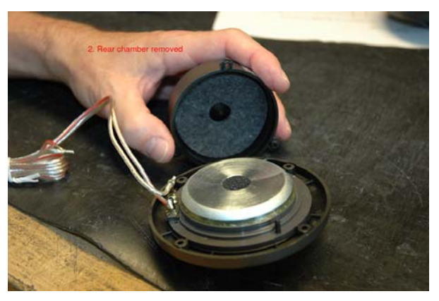
2. Rear chamber removed.