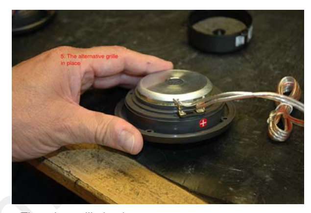
5. The other grille in place.