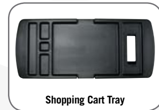
Shopping Cart Tray