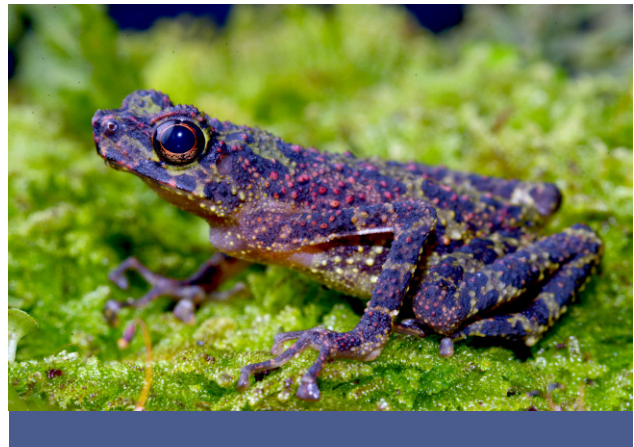
Fig. 2. Ansonia latidisca