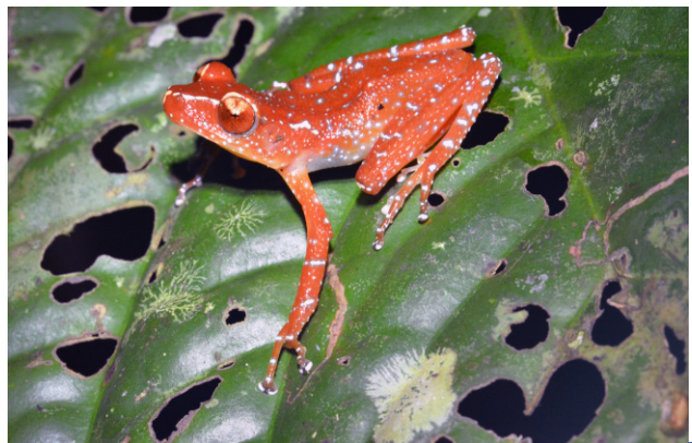
Fig. 18. Nyctixalus pictus