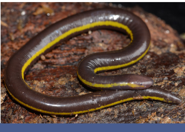
Fig. 12. Ichthyophis biangularis