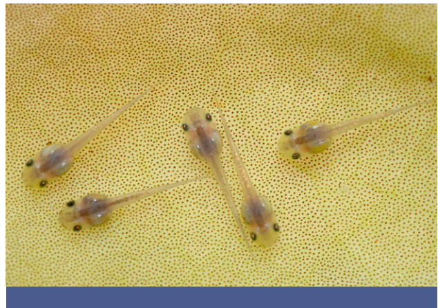
Fig. 4. Microhyla nepenthicola tadpoles