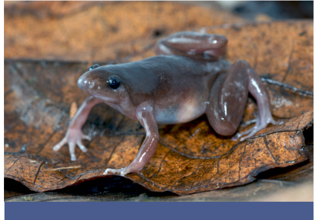
Fig. 1. Gastrophrynooides borneensis