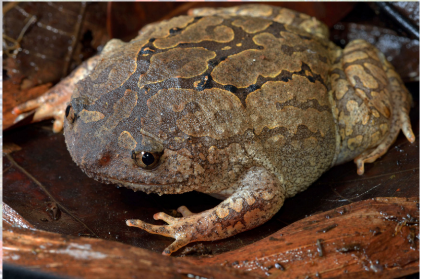
Fig. 9. Glyphoglossus brooksii