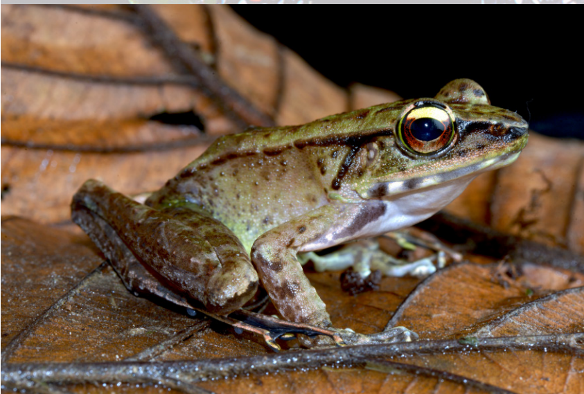
Fig. 6. Meristogenys penrissenensis