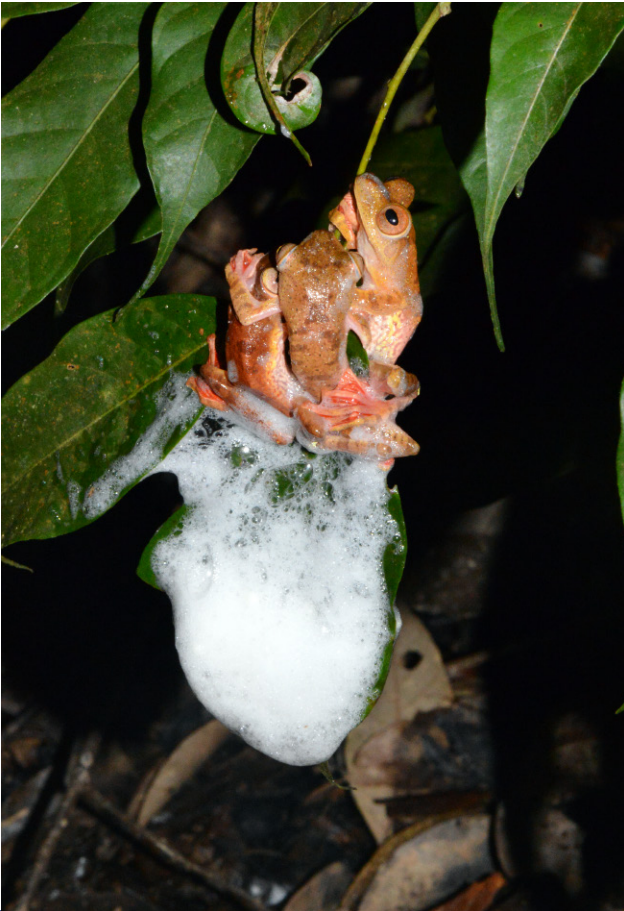
Fig. 15. Rhacophorus pardalis