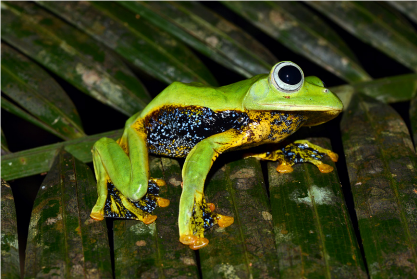
Fig. 5. Rhacophorus borneensis