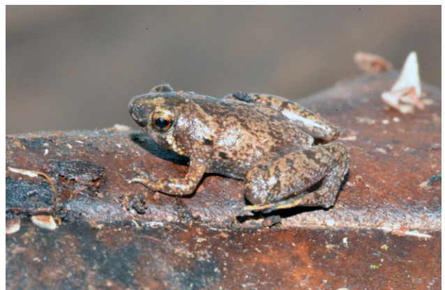
Fig. 14. Microhyla borneensis