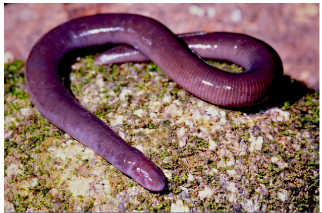
Fig. 13. Ichthyophis monochrous