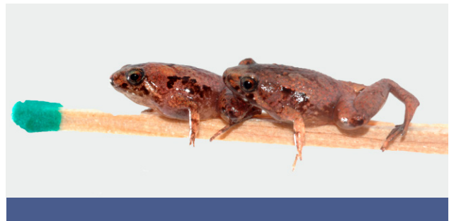
Fig. 3. Microhyla nepenthicola adults