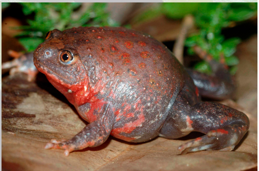
Fig. 10. Glyphoglossus capsus