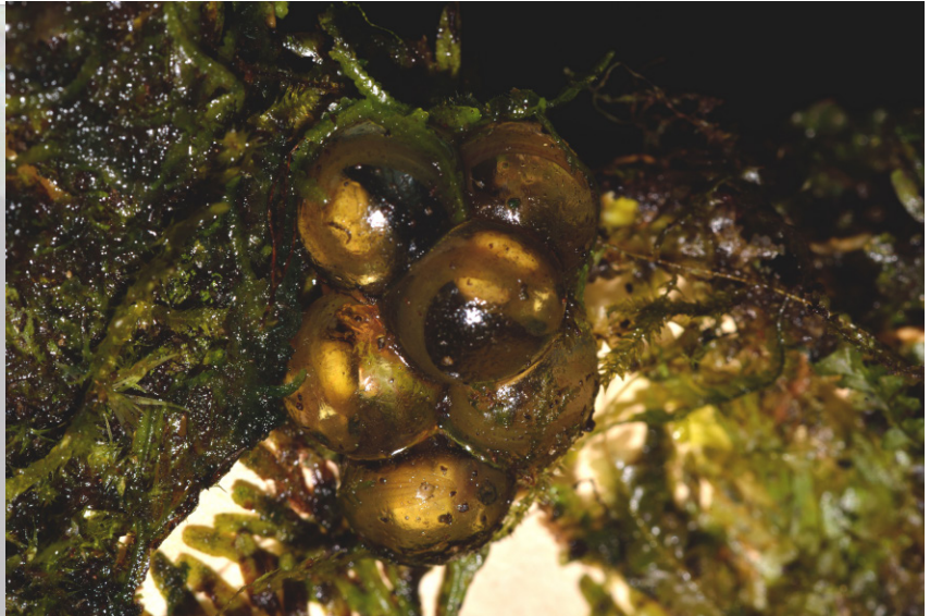
Fig. 8. Philautus tectus eggs

The Sama Jaya Forest Park or Stutong Nature Reserve (37.92 hectares) is located within the city of Kuching, and forms its south-western suburbs. Its Kerangas (Bornean heath) forest and peaty conditions are perfect for a number of swamp specialist frogs, such as Ingerophrynus quadriporcatus , Pulchrana baramica , and Polypedates colletti . In the shallow muddy pools, one can easily encounter Occidozyga