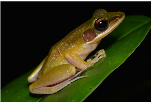
Fig. 11. Hylarana raniceps

In this short article is an attempt to fit all frogs and frog-watching sites general visitors to some of Sarawak’s National Parks and other wilderness areas around Kuching can hope to see. More intrepid herpetologists, with time in hand may consider travelling further afield – perhaps to Gunung Mulu National Park (52 860 hectares), over an hour’s flight from Kuching to Sarawak’s interior – to see some of the 105 amphibian species recorded from that Park.