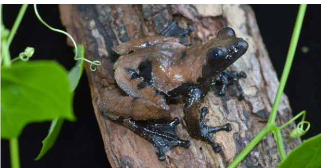
Fig. 16. Theioderma lacin