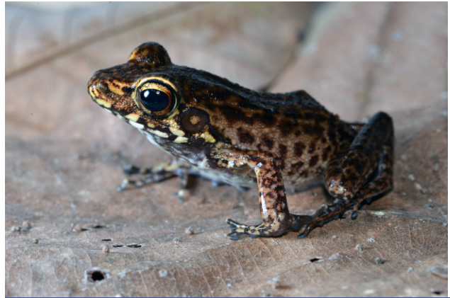
Fig. 17. Pulchrana baramica