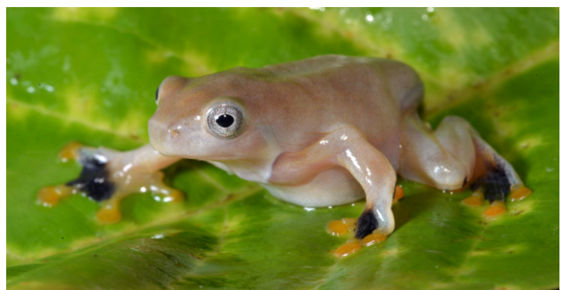
Fig. 14. Rhacophorus borneensis juvenile