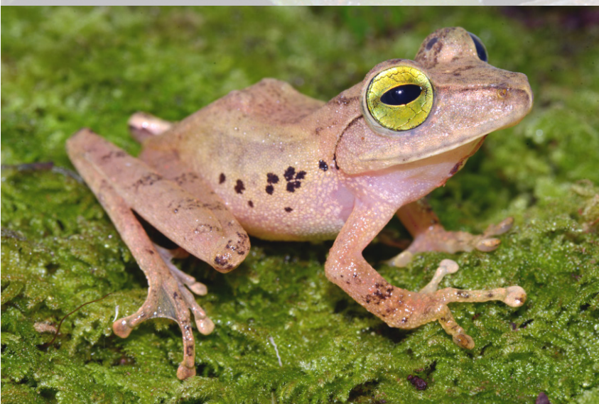
Fig. 7. Philautus hosii

Further research will indicate where the tadpoles develop. These caves are visited by cityfolks on weekends, the highlights being the long plank walks within the caves, the chittering sound of bats overhead and the edible-nest swiftlets, whose nests are stuck at improbable angles, within spitting distance of the plank walks.