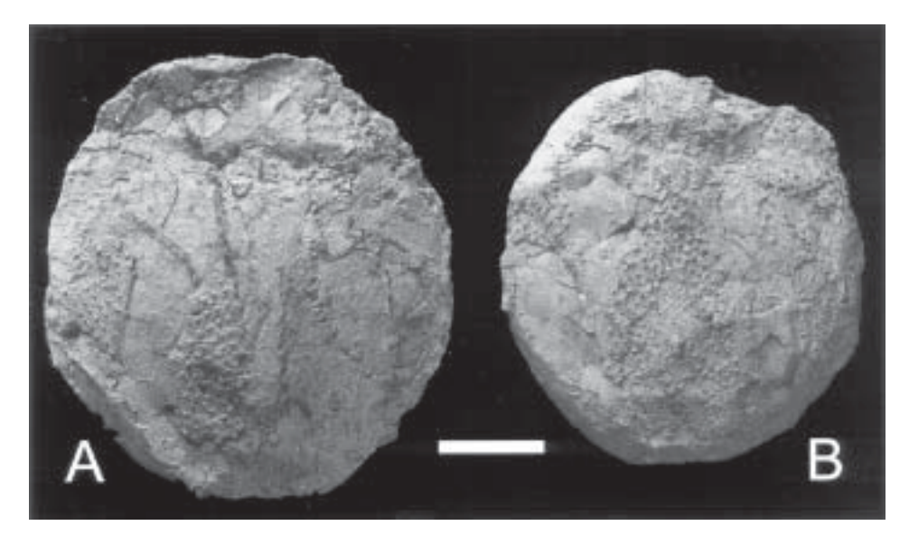
Fig. 2. Ventral view of Brissopsis lyrifera (Forbes 1841). Scale bar equals 10 mm. A: MGUH 25628. B: MGUH 25629.

V. End of madreporic plate smoothly rounded, extending nearly the length again of genital plates 1 and 3 from posterior genital plates (Fig. 1B). Genital plates 1, 3 and 4 more or less hexagonally rounded.