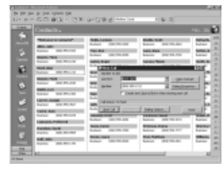
CTI lets you dial directly from applications, such as Microsoft Outlook.

The SuperStack 3 NBX solution includes TAPI (telephony application programming interface)-enabling software, which allows customers to integrate third-party CTI programs for advanced office applications. For example, companies can use contact management and database applications that allow customer service and order entry personnel to receive instant screen "pop-ups" of customer records with incoming calls. Also, CTI enables on-screen point-and-click calling directly from the computer.