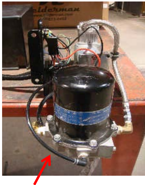
This air line connects to the manifold or directly to pressure switch.