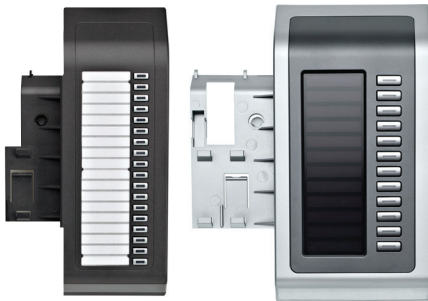
OpenStage Key Module 15, 40, 60