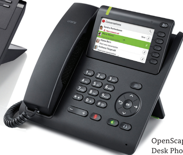
OpenScale Desk Phone CP600

“Unify’s efforts to extend HD voice across its entire IP portfolio with AudioPresenceHD® increase the overall value of its already high quality proven IP desktop phones, allowing customers to enjoy a natural voice experience with higher voice quality, superior clarity, better intelligibility and a richer sound experience. The overall result is higher degrees of customer satisfaction and increased productivity.”