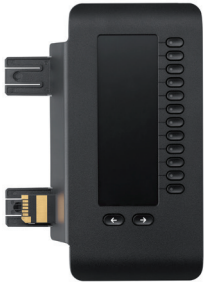
KM600 Key Module for the OpenScape Desk Phone CP600 and CP600E