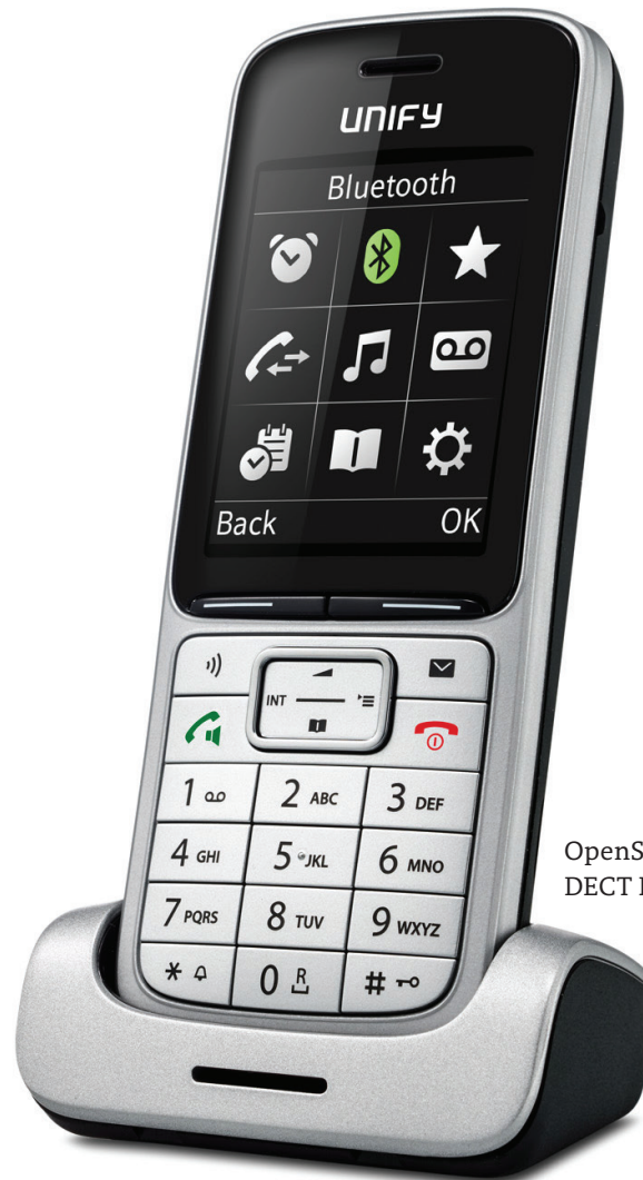
OpenScope DECT Phone SL5

Unify gives you more competitive advantages with wireless solutions: