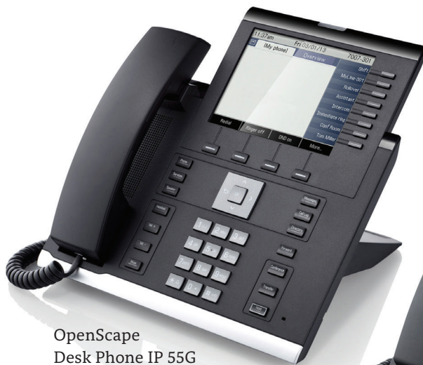
OpenScale Desk Phone IP 55G

Setting the benchmark for open, unified communications that boost productivity and streamline workflow with the most used office device - the telephone.