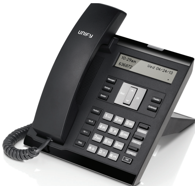
OpenScape Desk Phone 35G Eco