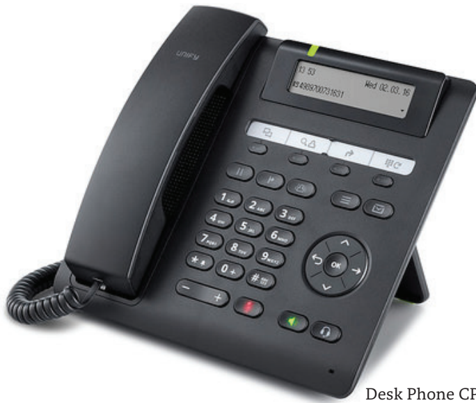
OpenScope Desk Phone CP200 / CP205