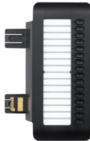
KM400 Key Module for the OpenScape Desk Phone CP400