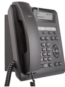
Wall Mount Kit available for OpenScape Desk Phone CP200, CP205, CP600 and CP600E