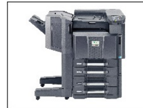
Standard Printer + *DF-770(B) 1,000 sheet Finisher + *PF-730 Paper Feeder