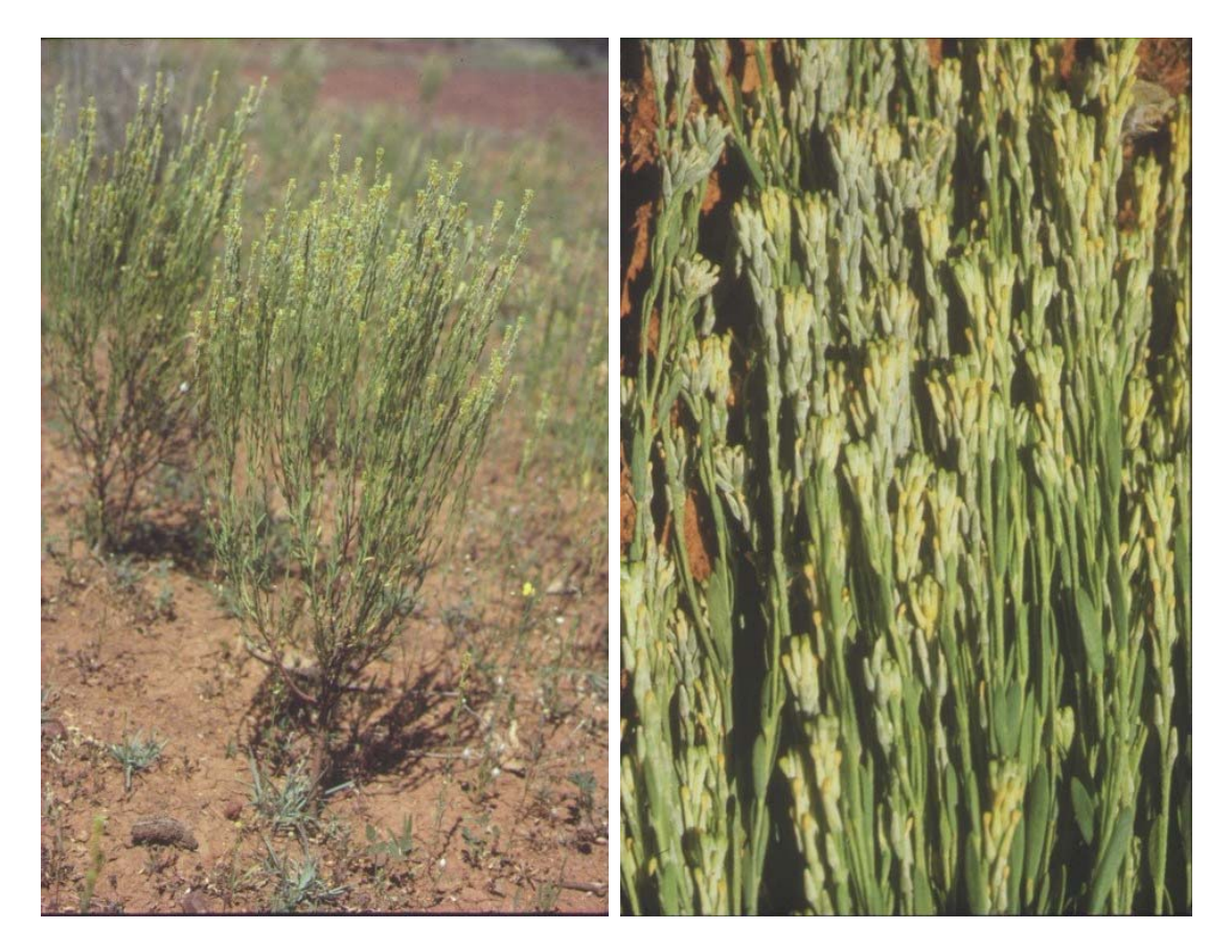
Pimelea elongata