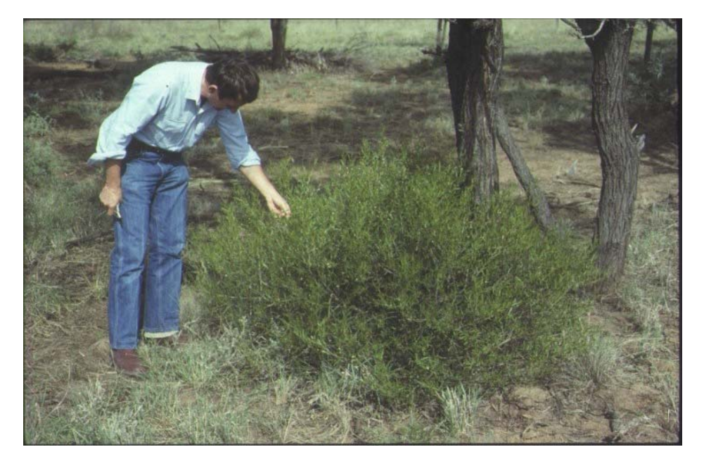
Eremophila deserti [= Myoporum deserti ] whole plant