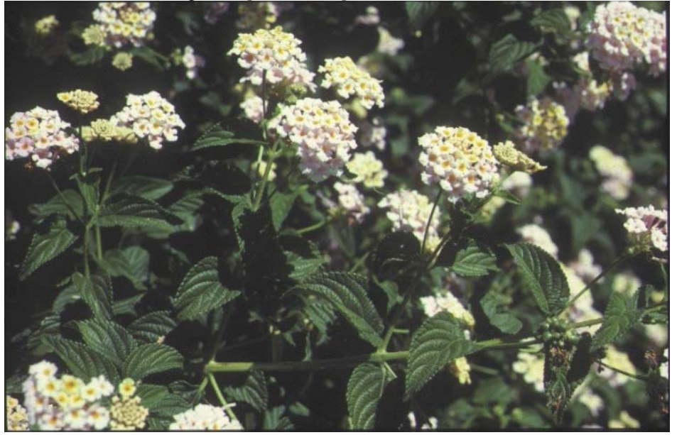
Lantana camara Helidon white [RAM Photo]

Lantana camara Pink-edged red [RAM Photo]