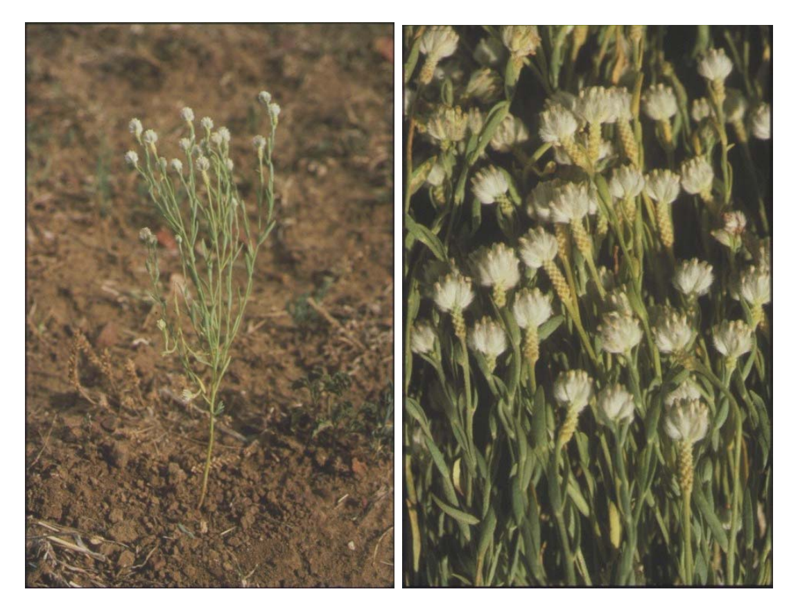
Pimelea simplex ssp. continua