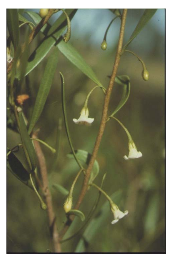
Eremophila deserti (= Myoporum deserti)