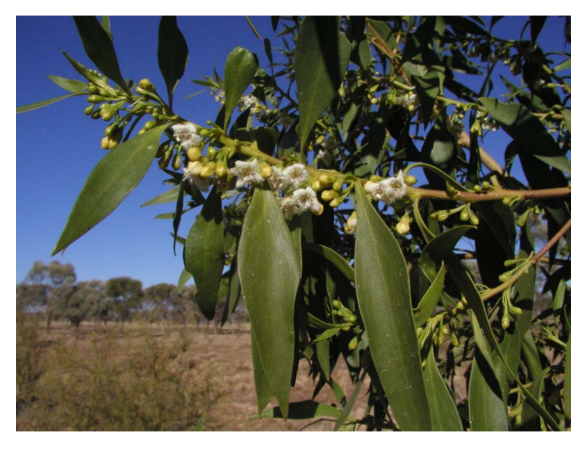
Myoporum acuminatum (boobialla) flowering branch