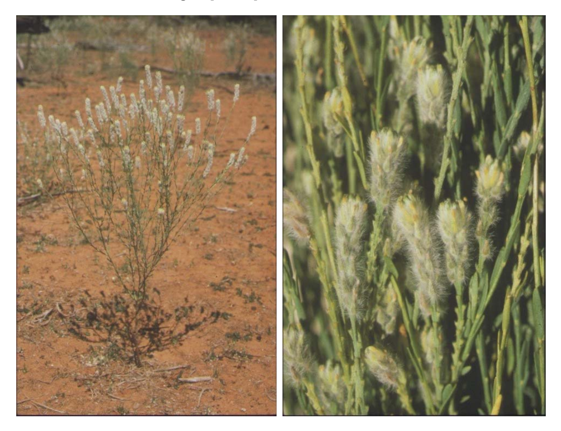
Pimelea trichostachya

Pimelea trichostachya (flax weed, rice flower, broom bush, Borgia's bouquet) [DM101] Pimelea simplex ssp. simplex (desert rice flower) Pimelea simplex ssp. continua [DM102] Pimelea elongata [DM102]