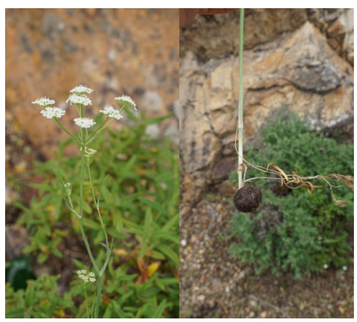
Fig. 1. B. crassifolium Batt. (Aerial part and bulb) (Original)

Results were evaluated as percentage (%) area of VOCs of B. crassifolium. The oven temperature program, using an Agilent DB-WAXETR column (60m×0.32mm, 0.25µm), was as follows: between 60 to 150°C at 5°C.min-1, 2min hold; between150 to 220°C at 3°C.min-1, 2min hold. The injection volume was 1µL and the carrier gas was helium at a flow rate of 1.5mL min-1. To perform the analyses, 2g aerial part samples of B. crassifolium were placed in 20 mL glass vials sealed with aluminum seals and and polytetrafluoroethylene septa (Koldas et al., 2015).