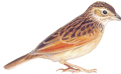
Adult M.j. athertonensis (Atherton-Mareeba uplands, n-e Qld)