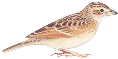
Adult M.j. secunda (lower reaches of Murray-Darling & S.A.)