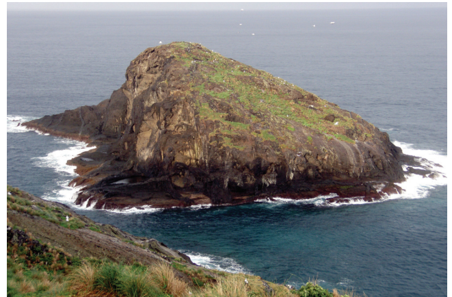
• South Island from the north-northwest showing the entire vegetated section of the island. Viewed from Roach Island.

the island, and several birds were found in burrows. The extent of potential nesting habitat is estimated at approximately 0.3 hectares.