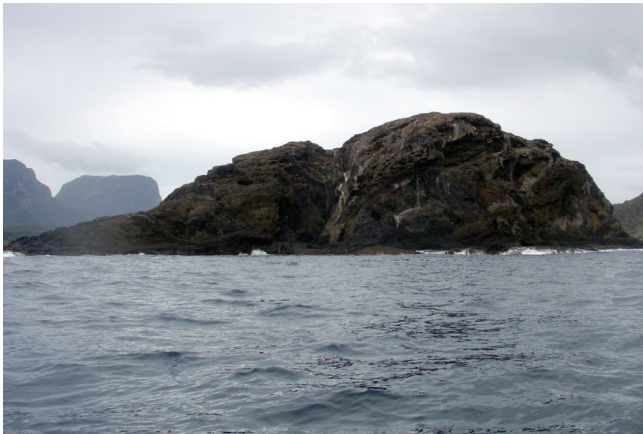
• South Island from the north. Lord Howe Island is in the background, with Mount Lidgbird and Mount Gower on the left and the Northern Hills on the right.