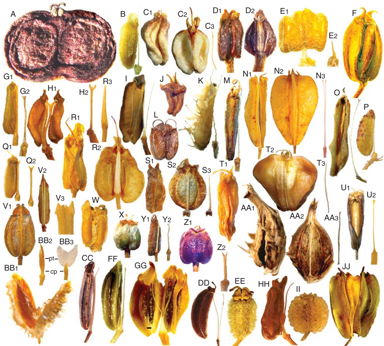
FIG. 1. Fruits of representatives of Apiaceae showing the shape and type of carpophore: in lateral view in A, B, C1 D1, E1, F1, G1, G2, H1, H2, I, M, N1, O, P, Q1, Q2, R, T1, U1, V, W1, X, Y, Z1, AA1, AA2, BB1, CC1–CC3 and DD–JJ, and in commissural view in C2, C3, R2, R3, S2, S3, W2, W3, BB2 and BB3. (A) Mackinlaya confusa . (B) Asteriscium aemocarpon . (C1–C3) Azorella compacta . (D) Bolax gummifera . (E1, E2) Bowlesia incana . (F) Dichosciadium ranunculaceum . (G1, G2) Dickinsia hydrocotylodes . (H1, H2) Diplaspis hydrocotyle . (I) Diposis saniculaefolia . (J) Domeykoa amplexicaulis . (K) Drusa oppositifolia . (L) Eremocharis triradiata . (M) Gymnophyton polycephalum . (N1–N3) G. isatidicarpum . (O) G. robustum . (P) Homalocarpus dichotomus . (Q1, Q2) Huanaca acaulis . (R1–R3) Hermas villosa . (S1–S3) Klotzschia glaviozii . (T1–T3) Laretia acaulis . (U1, U2) Mulinum spinosum . (V1–V3) Oschatzia cuneifolia . (W) Pozoa volcanica . (X) Schizeilema ranunculus . (Y1, Y2) Spananthe paniculata . (Z1, Z2) Stilbocarpa lyallii . (AA1–AA3) Arctopus echinatus . (BB1–BB3) Choritaenia capensis . (CC) Annesorhiza altiscapa . (DD) Bupleurum mundii . (EE) Dipolophium buchananii . (FF) Foeniculum vulgare . (GG) Heteromorpha involucrata . (HH) Lichtenisteinia trifida . (II) Phlyctidocarpa flava . (JJ) Polemanniopsis marlothii . Abbreviations: cp, carpophore; pt, parenchyma tissue. Scale bars = 0.4 mm in V3, 3 mm in others.

Group A. Carpophore absent; ventral vascular bundles as long as mericarps, arranged on opposite sides of the commissural plane (Fig. 3A)