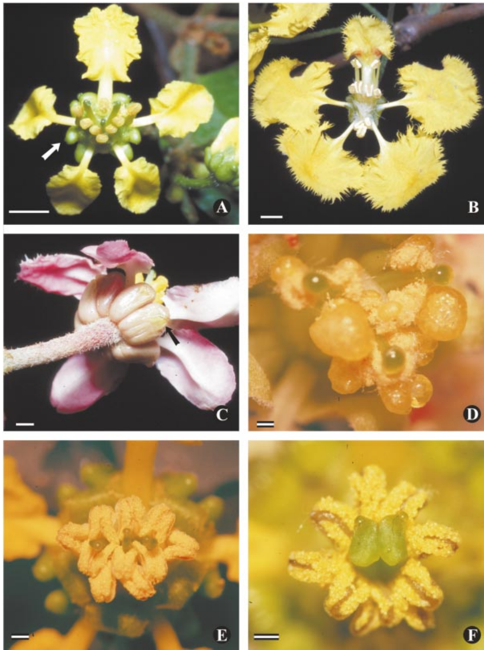
FIG. 1. (A–F) Flowers of Mascagnia sepium and Banisteriopsis lutea showing the different flag petals, and the presence (A) or lack (B) of elaiophores (arrow). Scale bars = 2.5 mm. (C) Elaiophores of M. cordifolia with oil accumulated under the transparent cuticle (arrow). Scale bar = 1.0 mm. Arrangements of styles/stigmas and stamens in flowers of (D) B. adenopoda , (E) Tetrapteryx guilleminiana , and (F) Dicella bracteosa . Scale bars = 5.0 mm.

broken but its rupture needs mechanical factors, usually floral visitors, and mainly pollinators (Fig. 2D). The stigmas of flowers isolated in waterproof bags displayed intact cuticles and no pollen (Fig. 2C). Malpighiaceae species have a special type of ‘wet’ stigma (cf. Heslop-Harrison and Shivanna, 1977; Heslop-Harrison, 2000), a feature already reported for many Leguminosae (Heslop-Harrison and Heslop-Harrison, 1983; Lord and Heslop-Harrison, 1984).