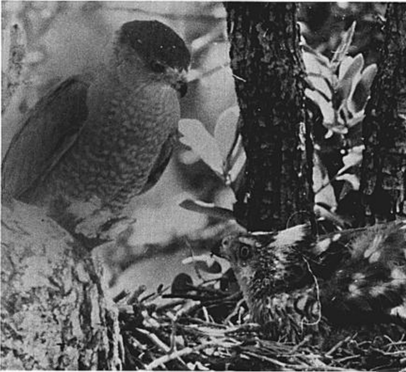
Fig. 5. Female Cooper's Hawk displaying the occipital region upon the male's arrival at the nest. Sunlight may enhance the spot in this photograph.

social signal associated with crest erection. All evidence gathered to date supports this proposal.