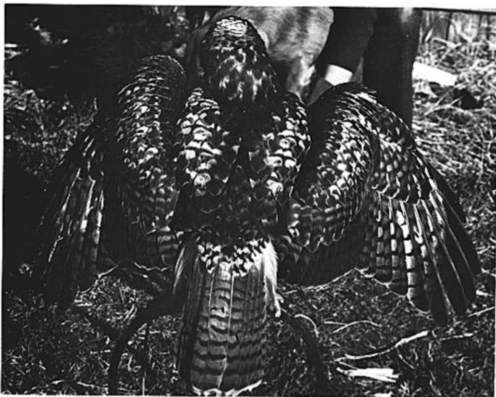
Fig. 6. During agonistic encounters, the spot of the Red-tailed Hawk is exposed to the rear and may function in deflection.

cal aggression. The accipitrid spot appears to be such a character. Helen Snyder (pers. comm.) working with Cooper's Hawks ( Accipiter cooperii ) reports that showing the back of the head, and concomitant display of the white spot, cause immediate behavioral inhibition on the part of the aggressor in this species. The red patch at the back of the head of young Water Rails, Rallus aquaticus (Lorenz 1952: 195), and the cryptic white of the White-necked Raven, Corvus cryptoleucus (Johnston 1958) are reported to be signal organs with this function.