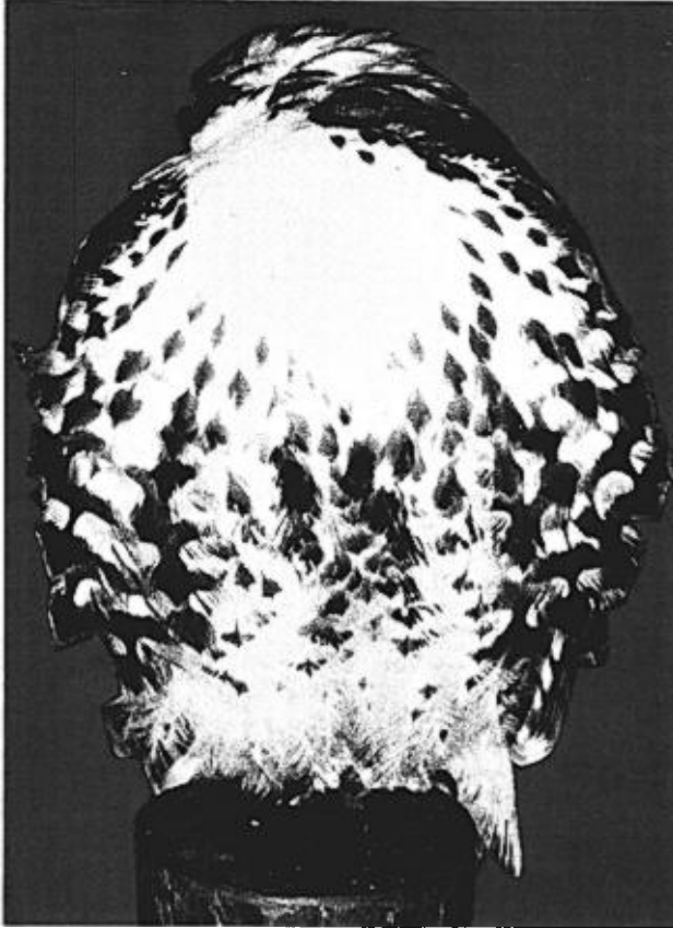
Fig. 7. Sleeping Red-tailed Hawk exhibiting the deflective facial disc.

human-imprinted birds. Hamerstrom and Hamerstrom (1972) report that during a sexual display, the male Red-tailed Hawk faces away. It is interesting to note that the bird "faced away" as he would be properly positioned to exhibit the spot. Frances Hamerstrom (pers. comm.) describes a captive female Red-tailed Hawk that flattened low in the nest and displayed the white occipital spot each time the male approached the nest. Helen Snyder (pers. comm.) similarly reports that the wild female Cooper's Hawk, when brooding eggs, erects the crest upon the male's arrival at the nest (Fig. 5). It seems apparent that the frontal stare is a signal of aggression, which is apparently appeased by the display of the spot. Such an appeasement gesture would logically precede any transfer of food from male to female at the nest site. Lastly the spot appears to be a significant social signal among nestlings of A. cooperii . Snyder further reports a strong back-turning response during conflict between siblings of this species and states that during this sort of struggle over prey, the crest is erected and the back of the head shows white in both sexes.