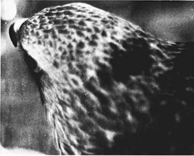
Fig. 2. Red-tailed Hawk showing the terminal darkening of the occipital spot feathers.

definitive spots while many Old World species exhibit poorly developed, possibly vestigial spots. Of the New World taxa examined, all had occipital spots except Leucopternis and the cosmopolitan Elanus . These two genera have pale heads in adult plumage, perhaps explaining the absence of the spot (see below). Four other genera, Elanoides , Busarellus , Harpia , and the cosmopolitan Haliaeetus have the spot in only the dark-headed juvenile plumage; the spot is not apparent on the pale-colored head of the adults.