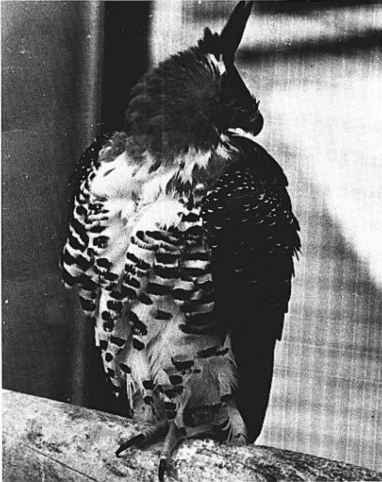
Fig. 4. The Ornate Hawk-Eagle ( Spizaetus ornatus ), among others, shows the white occipital spot each time the crest is erected.

genera, Haliastur and Gypaetus , have no spot in any plumage, but these genera have pale-colored heads in the adult plumage similar to that of the New World Leucopternis . Gypohierax has the spot in only the dark-headed juvenile plumage, the white head of the adult exhibiting no apparent spot. The three vulturine genera examined, Necrosyrtes , Gyps and Aegyptius , being "naked-headed," lacked the occipital spot. Lastly two Old World genera of accipitrids, Harpyopsis and Pithecophaga , lacked the spot.