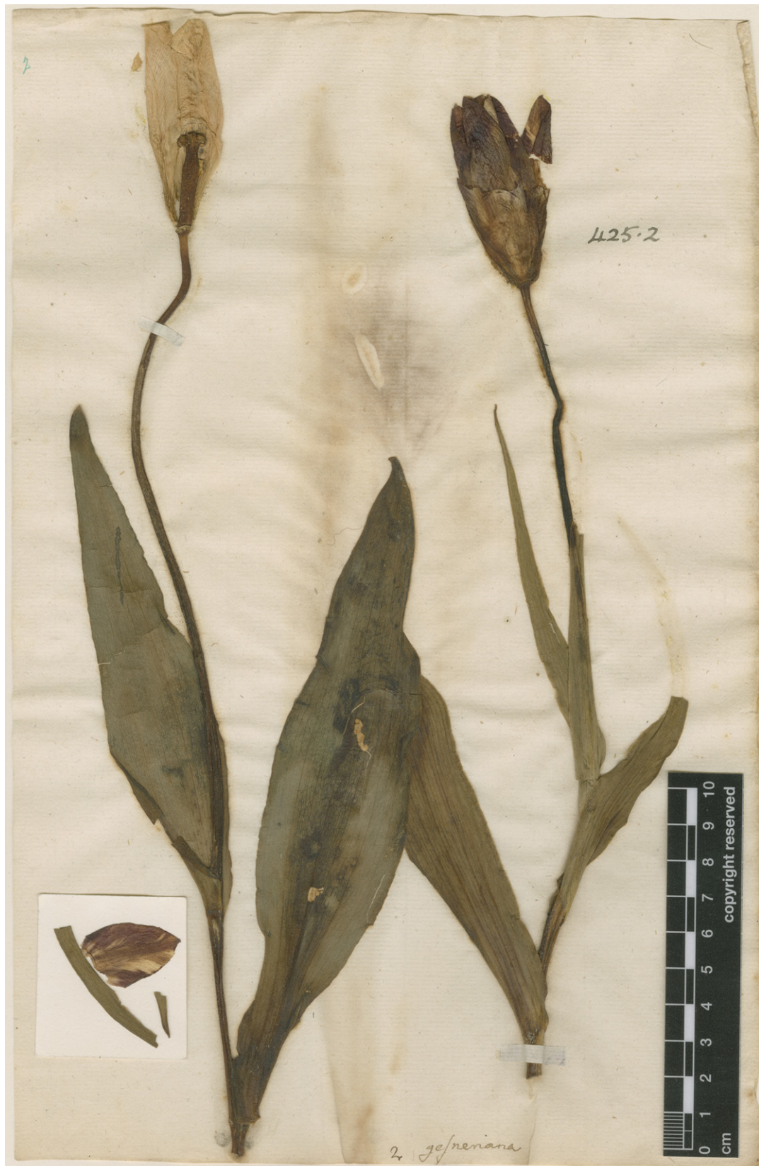
Figure 3. Lectotype specimen of Tulipa xgesneriana L. Linnean Herbarium no. 425.2 (LINN).