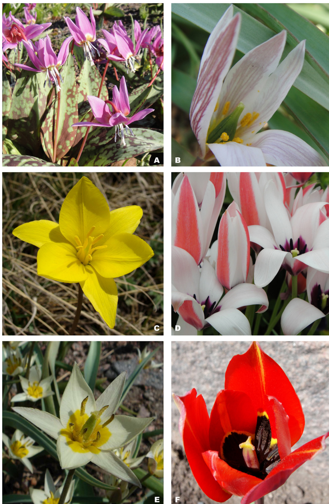
Figure 2. The Tulipa clade of Liliaceae tribe Tulipae. A, Erythronium dens-canis . B, Amana edulis . C, Tulipa uniflora (subgenus Orithyia ). D, Tulipa clusiana (subgenus Clusianae ). E, Tulipa turkestanica (subgenus Eriostemones ). F, Tulipa agenensis (subgenus Tulipa ).