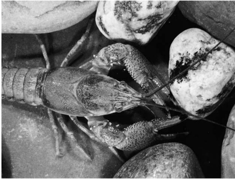
Fig. 1. Orconectes indianensis Hay in rock habitat.