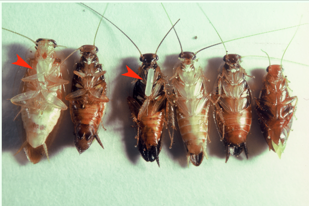
Figure 4. Contents of two-celled nest of Tachysphex inconspicuus with two and four prey, respectively, showing wasp eggs (arrows) affixed to forecoxal coria of 1 st and 3 rd cockroaches from left and extending longitudinally posteriad across thoracic venters. Riattia fulgida is on the far right; the other five cockroaches are Chorisonera species. Note amputated antenna segments on some of the prey. High quality figures are available online.

The nesting activities of the T. inconspicuus were interrupted frequently by several species of foraging ants of various sizes. One provisioning female disturbed by ants flew onto a leaf, 10 cm away, and released her