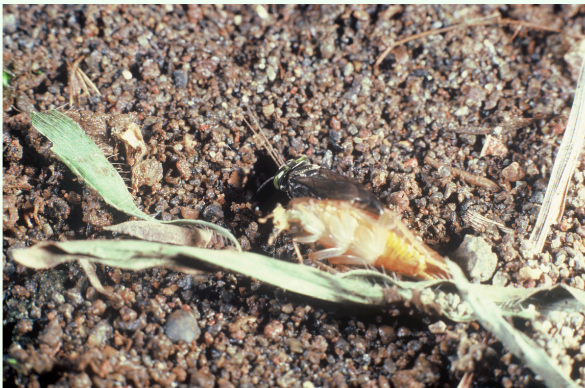
Figure 1. Tachysphex inconspicuus female removing temporary sand closure from nest entrance with forelegs while holding Chorisonneura prey to one side, perhaps with a hindleg, during nest entry. High quality figures are available online.