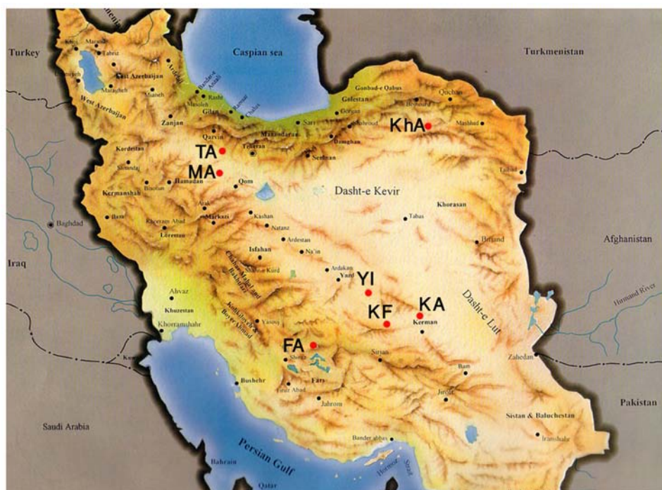
Figure 1. Distribution of collecting sites. See Table 1 for the codes.