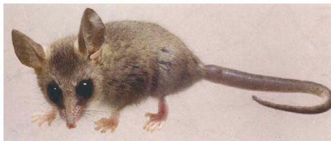
Fig. 1. —An adult Thylamys pallidior from Neuquén, Argentina.

The etymology of the genus name is derived from thylakos (Greek), meaning pouch, and mys (Greek), meaning mouse; the etymology of the specific epithet is derived from pallidus (Latin), meaning pallid, and ior (Latin), the masculine and feminine comparative ending (Braun and