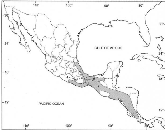
Fig. 3.—Geographic distribution of Peromyscus mexicanus (after Carleton 1989). 1, Peromyscus mexicanus angelensis ; 2, P. m. azulensis ; 3, P. m. mexicanus ; 4, P. m. putlaensis ; 5, P. m. saxatilis ; 6, P. m. teapensis ; and 7, P. m. totontepecus .

Tabasco eastward through the foothills of the Guatemalan highlands, the central valley of Chiapas and adjacent Guatemala and through El Salvador, extending as far south as extreme western Panama (Huckaby 1980). P. mexicanus appears to be absent from the forests of El Peten of Guatemala and Belize. Limits of range are unknown in the northern extension on the Pacific coast in the state of Guerrero and the eastern extension in the highlands of western Panama (Carleton 1989; Huckaby 1980). No fossils of P. mexicanus are known.