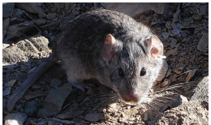
Fig. 1. —Adult male Abrocoma schistacea from El Leoncito National Park (San Juan Province, Argentina).