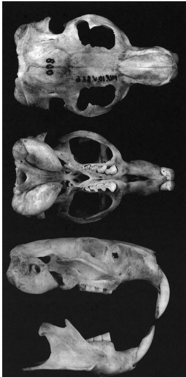
FIG. 2. Dorsal, ventral, and lateral view of cranium and lateral view of mandible of Ctenomys talarum (Museo de La Plata, MLP 10-V-87-6). Greatest length of skull is 43.84 mm.

Average litter size, from embryos and placental scars, was 4.09 \pm 0.18 ( SD ) ( n = 75 ). Right uterine horns tend to sustain more implantations than left cornu. Post-implantation losses are 2%. Based on the number of pregnant C. talarum during the breeding season, average number of litters year -1 female -1 is >1 . Except in June, sex ratios depart from 1:1, with an excess of females on the order of 1:1.63 (Malizia and Busch 1991; Malizia et al. 1995).