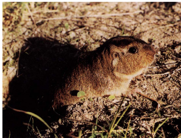
FIG. 1. Ctenomys talarum .

ONTOGENY AND REPRODUCTION. Male C. talarum have a long reproductive competence, although most reproduction occurs between winter and spring. Some males are active during summer and mid-autumn. All males are reproductive in July, and then slightly fewer from August to November. The breeding season for females is more restricted. The highest percentage of pregnancies occurs in August (Malizia and Busch 1991). Estimated lactation period was 45 days (Weir 1974).