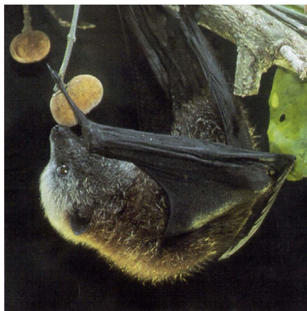
FIG. 1. Juvenile Pteropus samoensis samoensis from Samoa.

DISTRIBUTION. Pteropus s. samoensis is found only in the Samoan archipelago (Fig. 3) on all major islands, including