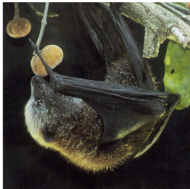
FIG. 1. Juvenile Pteropus samoensis samoensis from Samoa.

DISTRIBUTION. Pteropus s. samoensis is found only in the Samoan archipelago (Fig. 3) on all major islands, including