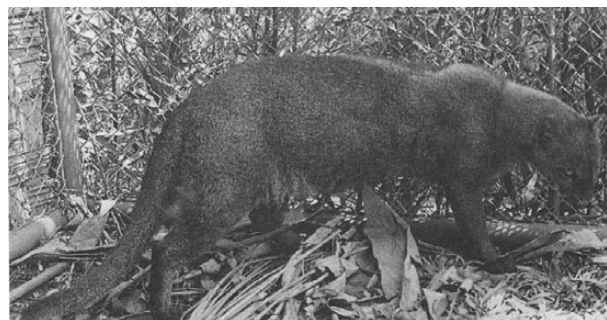
FIG. 1. Adult female Herpailurus yagouarundi eyra from São Paulo, Brazil.

The narrow and low skull has a short facial area, inconspicuous zygomatic arches, a temporal crest usually apart and forming