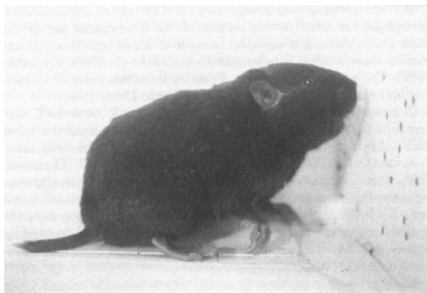
FIG. 1. Male Spalacopus cyanus from Lagunillas, Andes of central Chile.

DIAGNOSIS. Spalacopus cyanus is a burrowing rodent of moderate size, with a mass of <140 g, a short tail (41 mm), short ears (10 mm), and black in color (Fig. 1). Of all octodontids species,