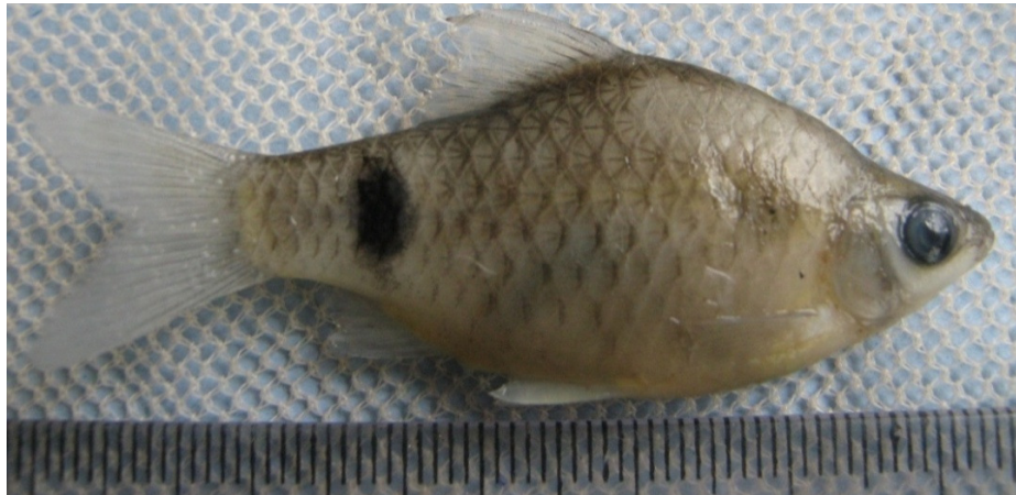
Figure 2. A specimen of one spot barb fish, Puntius terio (Hamilton).