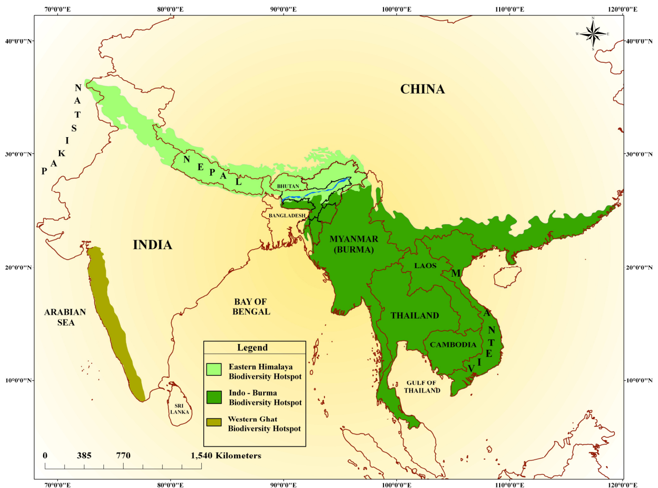
Figure 1. A digitised map showing the Himalayan and Indo-Burma biodiversity hotspot zones and the North Eastern states of India.

activities of oil explorations and direct contact of the crude oil, slugs with water and soil. The unplanned construction of embankments for preventing floods causes the loss of habitat, breeding ground and migration of fish. Several hydroelectric dams have already been constructed, or are under construction. Unplanned