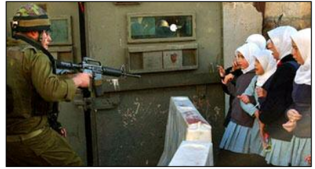
Schoolgirls at an Israeli checkpoint in occupied Hebron

Conventions an occupying power is responsible for the security and normal life of the residents of the territory of which they have taken control. Rather than taking this responsibility, Israel has sought to disrupt the functioning of Palestinian universities. Below are just some of the ways in which this happens.