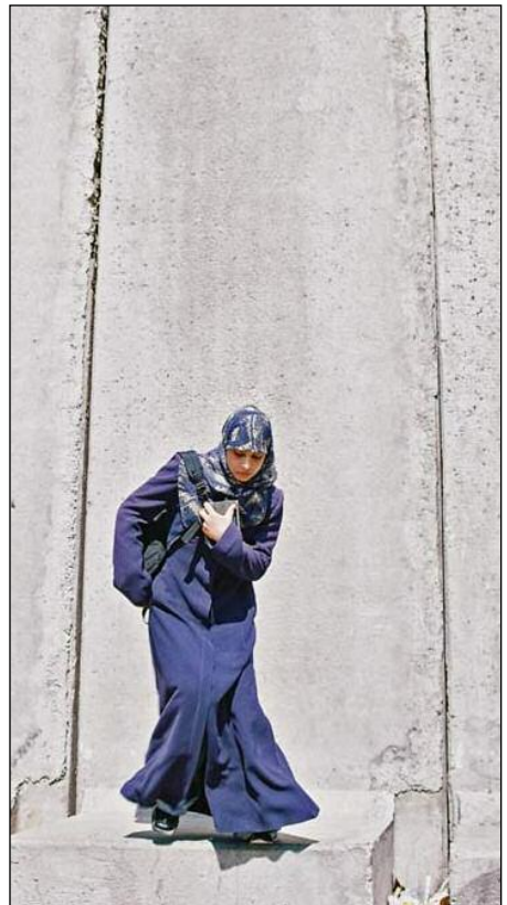
A student beside Israel's illegal wall, near Birzeit University

In the final section of this pamphlet we discuss in more detail what actions are needed to ensure that the boycott is fair and effective. However, firstly we lay out the reasons why people increasingly support this call to boycott Israel.