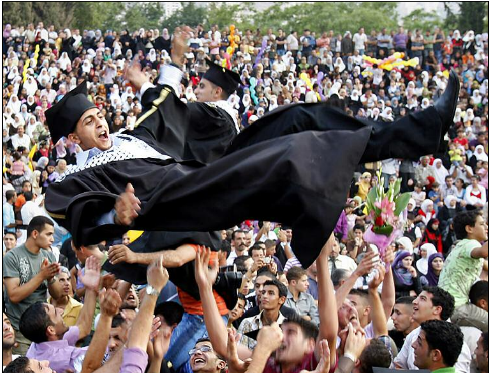
Palestinian students celebrate graduation in An-Najah University, Nablus