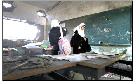
Palestinian schoolgirls in a destroyed classroom, Nov 2012

Over 6,800 Palestinians, the majority of them civilians and including over 1,500 children, have been killed by Israeli forces in military attacks, assassinations, and shelling of densely populated residential areas since the year 2000. Israeli forces have destroyed or damaged tens of thousands of Palestinian homes, vast areas of cultivated land including olive groves, and much crucial civilian infrastructure, including electricity power plants, roads,