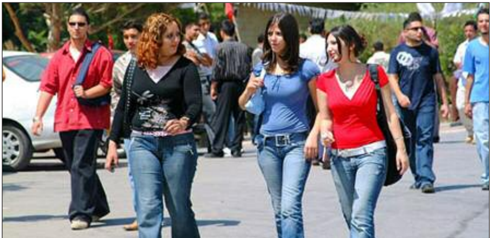
Palestinian students in Birzeit University in the Israeli-occupied West Bank

It is important to let Israeli institutions understand why you are taking the action that you are; the reason for not associating with them is not lack of time or interest, but because as an academic, you are taking the moral stand of respecting the Palestinian call for boycott. Stephen Hawking's decision in mid-2013 not to attend a conference in Israel sent a powerful message to Israelis and Palestinians alike. The reason it made such an impact was because he sent a letter to the conference organisers openly stating that he would not attend because he was heeding the advice of his Palestinian colleagues to respect the boycott. By informing the Israeli institution clearly and politely that you are one of a growing number of academics who support the boycott, you are informing them that 'business as usual' is no longer possible.