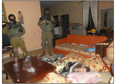
A punitive Israeli army night raid in the Palestinian village of Nabi Saleh. Such raids are common and are the cause of psychological trauma in young children and teenagers

The Committee is extremely concerned at the consequences of policies and practices which amount to de facto segregation, such as the implementation by the State party in the Occupied Palestinian Territory of two entirely separate legal systems and sets of institutions for Jewish communities grouped in illegal settlements on the one hand and Palestinian populations living in Palestinian towns and villages on the other hand. The Committee is particularly appalled at the hermetic character of the separation of two groups, who live on the same territory but do not enjoy either equal use of roads and infrastructure or equal access to basic services and water resources. Such separation is concretized by the implementation of a complex combination of movement restrictions consisting of the Wall, roadblocks, the obligation to use separate roads and a permit regime that only impacts the Palestinian population. 9