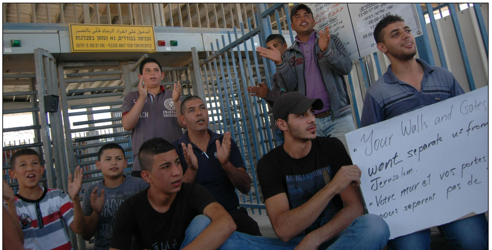
Young Palestinians at a-Zeitim checkpoint in East Jerusalem, between the neighborhoods of Abu Dis and At-Tur

• The Israeli army is a huge presence on campuses. It runs hundreds of its training sessions in Israel’s universities who vie with each other to attract such courses. The Hebrew University in Jerusalem offers a special fast-track degree programme to members of the General Security Service, or the Shin Bet, which has used its intelligence gathering abilities to maintain the occupation, and which stands accused of torture. The University of Haifa offers custom designed Masters programmes for Israeli soldiers, with the University’s rector stating that the University of Haifa was proud to be an “academic