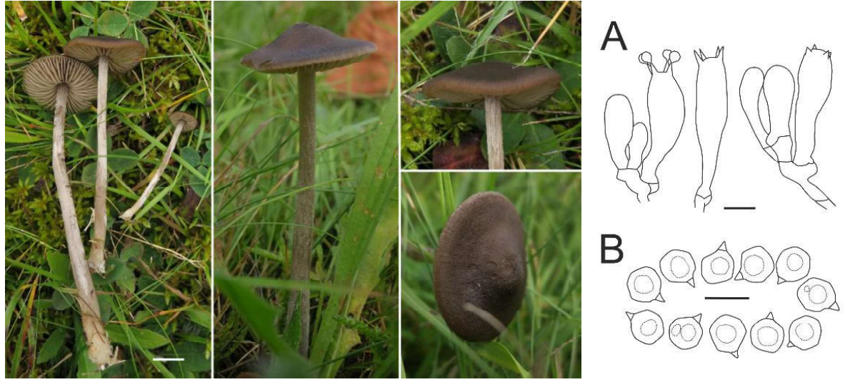
Fig. 2: Entoloma brunneosericeum – macroscopic characters in situ (left, bar = 1cm) – basidia (A) and spores (B), bars 10 μm.

Comments: According to its original description, E. brunneosericeum is restricted to montane to subalpine Pinus forests [12]. Besides ours, another collection from an alpine pasture in Protomagno (Italy) [13], has already given indication for its preference of unimproved grasslands. However, the collection illustrated herein is the first one from a colline area and the first record of this species in Germany. The respective ITS sequence was found to be identical to the sequence of the holotype (JX454894).