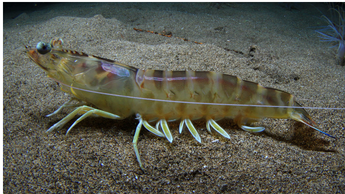
Fig. 4 – Penaeus kerathurus (Forskål, 1775) on a sandy bottom in Lanzarote Island; lateral view.