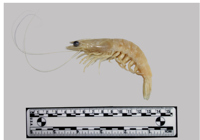
Fig. 2 – Penaeus kerathurus (Forskål, 1775), ICCM-398, CL = 31 mm, male, fixed.

P. kerathurus is a demersal species occurring in shallow coastal marine and brackish waters, living on sandy, sandy-muddy, muddy sand or shell gravel substrates (FRANSEN, 1991; D'UDEKEM D'ACÓZ, 1999), from 0.5 m (juveniles) to 90 m of depth, mainly between 5 m and 40 m (D'UDEKEM D'ACÓZ, 1999). It occurs in the eastern Atlantic, from southern England to Atlantic Morocco and Mauritania, southwards to northern Angola, the entire Mediterranean Sea and the Suez Canal (PÉREZ FARFANTE & KENSLEY, 1997; D'UDEKEM D'ACÓZ, 1999).