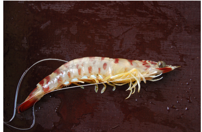
Fig. 1 – Penaeus kerathurus (Forskål, 1775), ICCM-398, CL = 31 mm, male, freshly caught.

of a marina ('Muelle Deportivo') at Las Palmas de Gran Canaria, NE of Gran Canaria Island, 5 June 2014, bottom shrimp-trap.