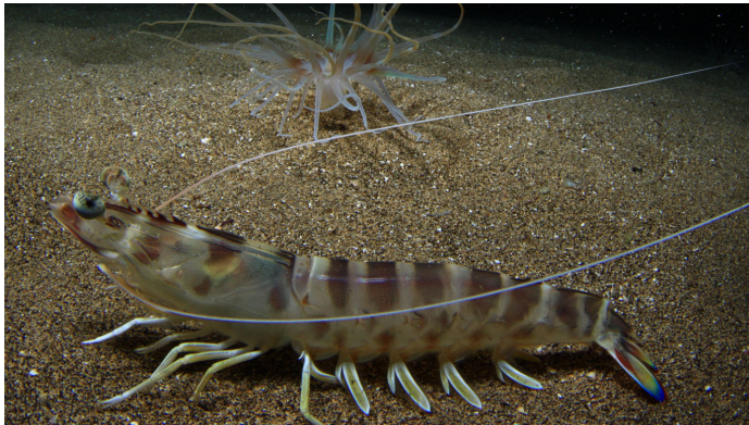
Fig. 3 – Penaeus kerathurus (Forskål, 1775) on a sandy bottom in Lanzarote Island; lateral view.

The present material represents the first record of this species from the Canary Islands. In the last five years, several underwater professional photographers have provided us with some superb photographs of this species taken in waters of Lanzarote (Figs. 3-5), Gran Canaria and Tenerife Islands. At last, a local fisherman provided us with one specimen of this uncommon and yet unrecorded Penaeidae.