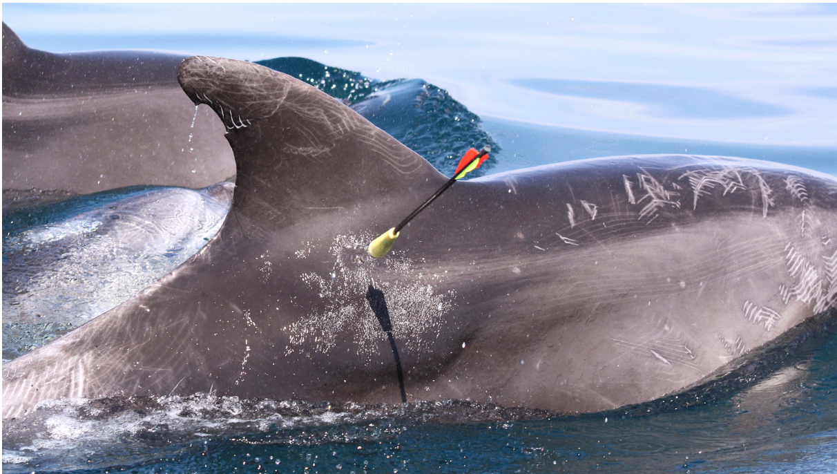
Figure 2. Biopsy sample collected from an adult free-ranging common bottlenose dolphin ( Tursiops truncatus ) in the Gulf of Trieste, northern Adriatic Sea, using a crossbow and a dedicated sampling dart.

The choice of equipment may be guided by a number of considerations, including the target species and their typical behaviours ( e.g. for species prone to bowriding, the pole system may be used, whereas for boat-shy species a remote system may be needed), the size of the target species (related to the choice of the power of the projectile delivery and the size of sampling tips), the vessel used, the costs and ease of obtaining various types of equipment, as well as local/national legislation related to the use of weapons/firearms. Typically, after recoiling from the sampled animal, the dart/bolt floats in the water and is collected by hand or by dip net. However, in certain conditions tethered darts may be used.