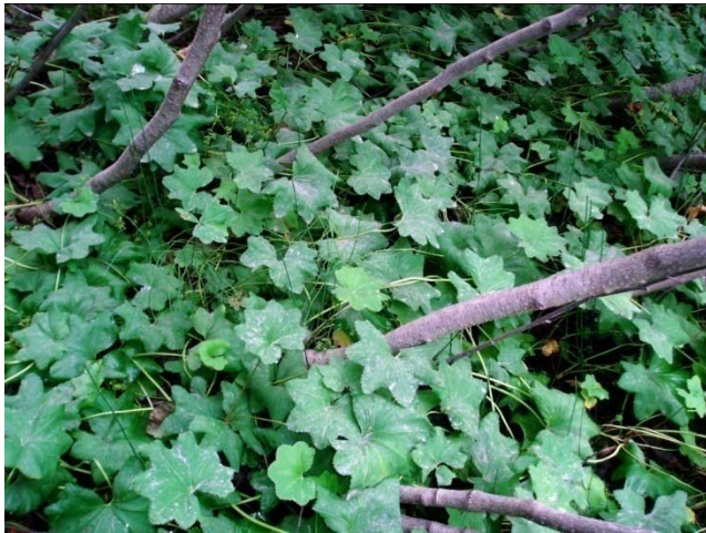
Alchemilla infestation under an alder canopy near a roadside in Hoonah, AK.

Similar species: No other species in Alaska can be easily confused with lady's mantle or hairy lady's mantle.