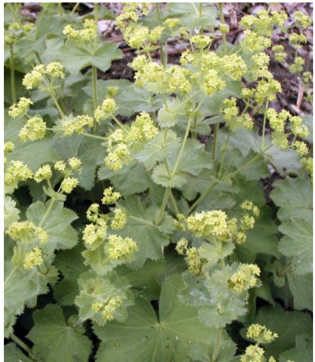
Inflorescences and foliage of Alchemilla mollis (Buser) Rothm.

Hairy lady's mantle looks similar to lady's mantle but differs by the following features. Stems are up to 50 cm tall. Teeth on the leaf margins are more pointed. The space between basal lobes on either side of the petiole is narrow or closed. Upper inflorescence branches and pedicels are glabrous. Hips are glabrous to sparsely hairy (Stace et al. 2005, Bojňanský and Fargašová 2007).