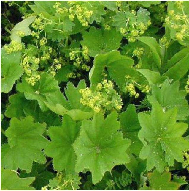
Inflorescences and foliage of Alchemilla monticola Opiz.

Similar species: No other species in Alaska can be easily confused with lady's mantle or hairy lady's mantle.