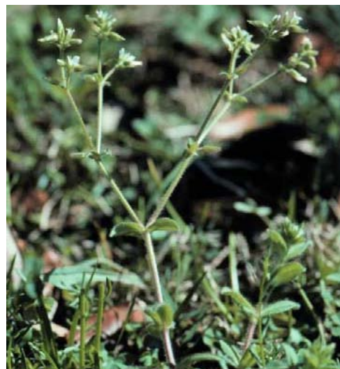
Cerastium glomeratum .