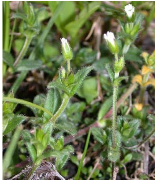
Cerastium fontanum ssp. vulgare . Photo by M. Harte.

Sticky chickweed can be distinguished from common mouse-ear chickweed by its viscid stems and leaves.