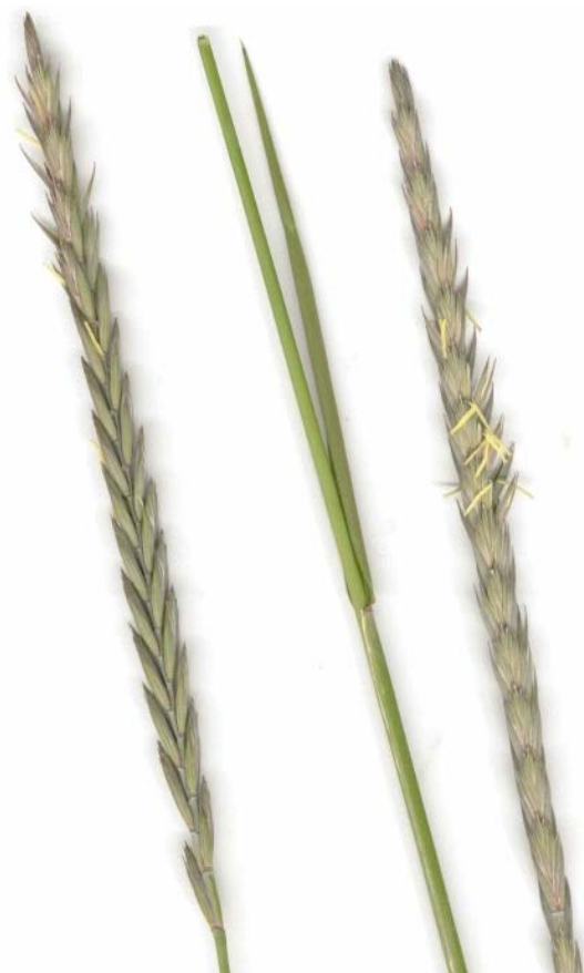
Elymus repens (L.) Gould.

Role of disturbance in establishment: Quackgrass readily colonizes disturbed, bare ground but can also invade undisturbed, grassy habitats.