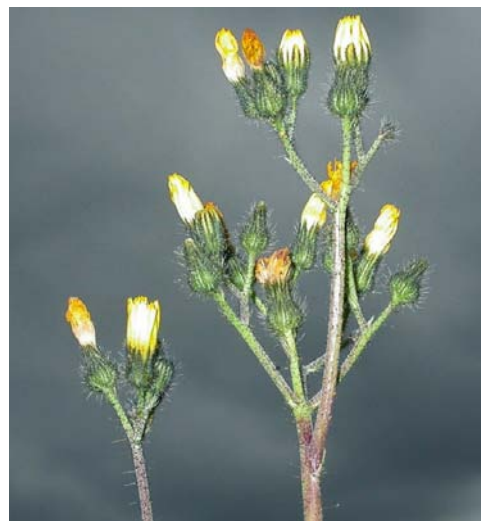
Hieracium caespitosum Dumort.

Meadow hawkweed is perennial herb that grows from short, stout rhizomes and long, leafy stolons. Stems are erect, solitary, and up to 91 cm tall. They are covered in glandular, star-like hairs. Stems exude milky juice when broken. Basal leaves are well-developed, persistent, oblanceolate to spoon-shaped, entire or minutely toothed, 5 to 26 cm long, and 2 ½ cm wide. They have stalks and are covered with non-glandular hairs. One to three smaller leaves grow up the stem. Stems bear up to thirty 13 mm flower heads near the top. Ray flowers are yellow. Seeds are black and tiny (Idaho's noxious weeds 2003).