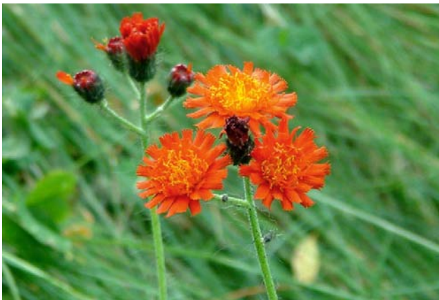
Hieracium aurantiacum L.

Orange hawkweed is a perennial herb that has shallow, fibrous roots, stolons, and well-developed basal rosettes. Stems can reach a height of 30 ½ cm and bear up to thirty flower heads near the top. Stems and leaves exude milky latex when cut or broken. Leaves are oblanceolate to narrowly elliptic, up to 13 cm long, hairy, and almost exclusively basal. Flower heads are 13 mm in diameter. Flowers are red to orange. Seeds are oblong, purplish-black, and about 2 mm long (Gleason 1968, Hultén 1968, Royer 1999).