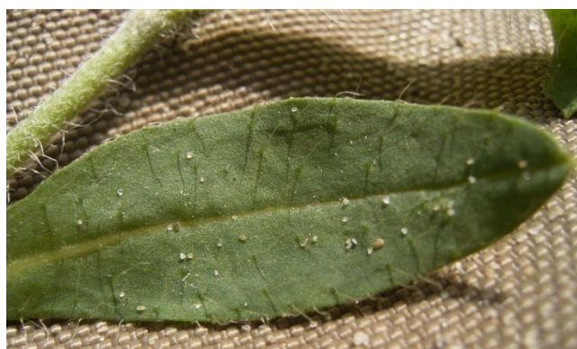
Hairy leaf of Hieracium pilosella L.

Mouse-ear hawkweed is a stoloniferous, perennial plant that grows 10 to 40 cm tall. Plants exude milky juice when broken. Stems are hairy and erect. Basal leaves are hairy, elliptic to oblanceolate, 10 to 75 mm long, and 5 to 18 mm wide with cuneate bases and entire margins. Leaves of the stolons are similar but smaller. Stem leaves are absent or few. When present, they are reduced in size up the stem. Flower heads are usually borne singly or, less commonly, in groups of two or three at the ends of stems with 60 to 120 florets each. Peduncles are hairy. Involucres are hemispheric or obconic and 7.5 to 11 mm long with black hairs. Florets are yellow, strap-shaped, 8 to 13 mm long, and often red-tinged on the lower surfaces. Seeds are cylindrical and 1.5 to 2 mm long. Each seed has a pappus composed of 30 or more bristles that are 4 to 5 mm long (Strother 2006, Klinkenberg 2010).