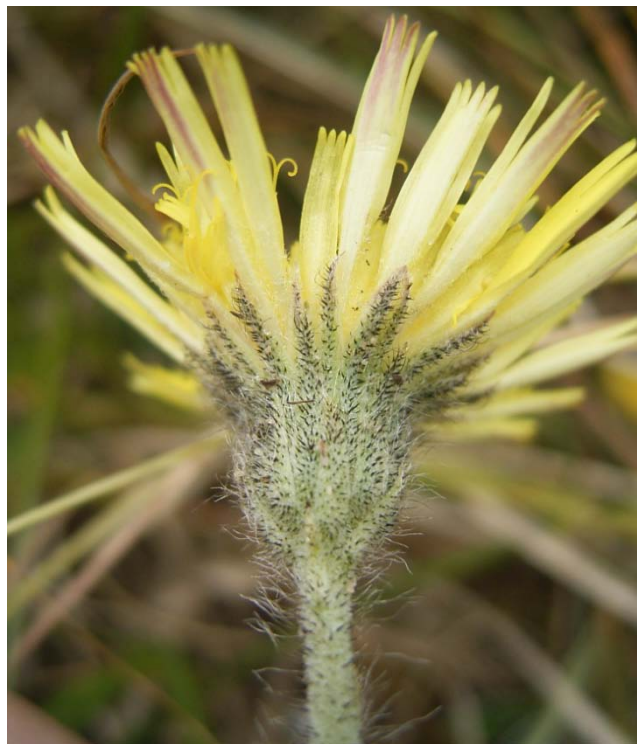
Hairy involucre of Hieracium pilosella L.

from mouse-ear hawkweed by the presence of groups of 5 to 20 flower heads arranged at the ends of stems, stems up to 1 m tall, two rows of involucral bracts, white hairs on the involucres, and leaves that are often coarsely pinnatifid. Unlike mouse-ear hawkweed, common dandelion (including the native Taraxacum officinale ssp. ceratophorum and the non-native Taraxacum officinale spp. officinale ), hairy cat's ear ( Hypochaeris radicata ), and fall dandelion ( Leontodon autumnalis ) have deeply lobed, pinnatifid, or coarsely toothed leaves (Strother 2006, eFloras 2008, Klinkenberg 2010).