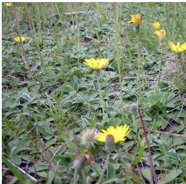
Mat of Hieracium pilosella L. in a meadow in Germany.

Impact on ecosystem processes: In New Zealand, mouse-ear hawkweed reduces the nitrogen and phosphorus content of fescue tussock, suggesting that this species limits the availability of nutrients (Makepeace et al. 1985). Infestations increase soil pH by up to 0.5 and increase the amount of organic carbon and soil exchangeable calcium, magnesium, and potassium in the soil (McIntosh et al. 1995).