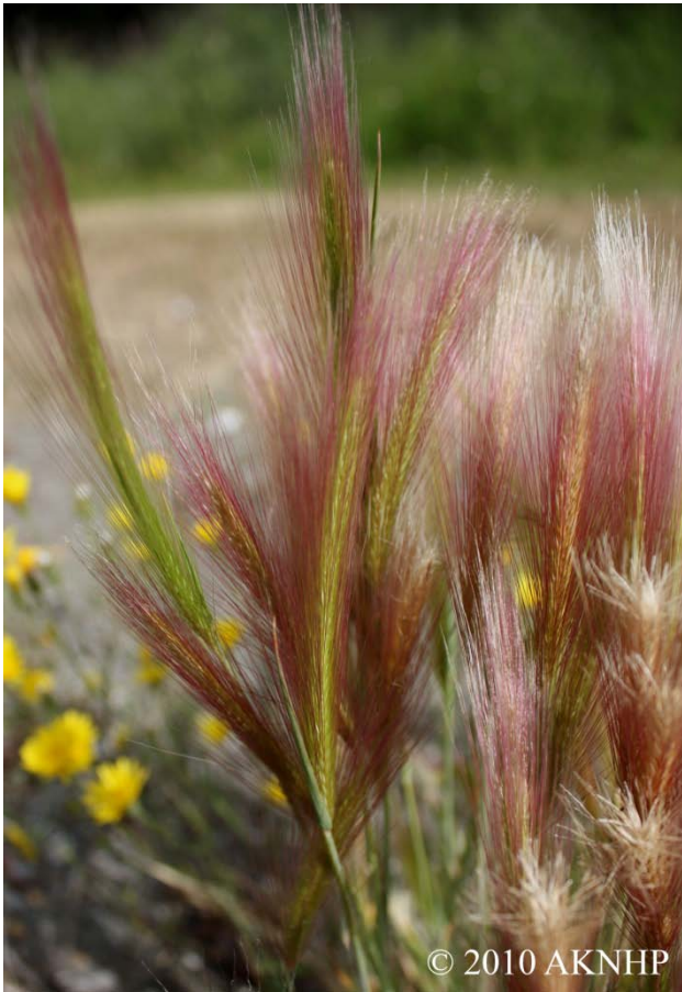
Hordeum jubatum L.

Foxtail barley is a non-rhizomatous, annual to perennial grass that grows 30 ½ to 61 cm tall. It is native to western North America. Leaves are gray-green, rough, and 2 to 3 mm wide. Sheath margins have numerous soft hairs. Spikes are nodding, pale green to purple, and bushy. At maturity, spikes fade to a tawny color and become very brittle. Awns are 13 to 76 mm long. Seeds are elliptic, yellow-brown, and 6 mm long. Each seed has 4 to 8 awns and sharp, backward-pointing barbs (Hultén 1968, Royer and Dickinson 1999, Whitson et al. 2000).