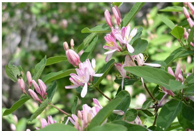
Flowers and foliage of Lonicera tatarica L.

Tatarian honeysuckle is a bushy, finely branched shrub that can grow up to 3 meters tall. Trunks have gray-brown bark in long, thin scales that do not readily shed. Branches are thin, flexible, and brown to green-brown. Older stems are often hollow. Leaves are hairless, opposite, ovate to oblong, and 25 ½ to 64 mm long. They have entire margins, obtuse to acute tips, and rounded bases. Flowers are pink or white, less than 2 ½ cm long, tubular, and paired. Fruits are orange to red-orange, spherical, and 5 to 7 mm wide. Each berry contains several seeds. Seeds are oval, flattened, and yellow (Welsh 1974, Butterfield et al. 1996).