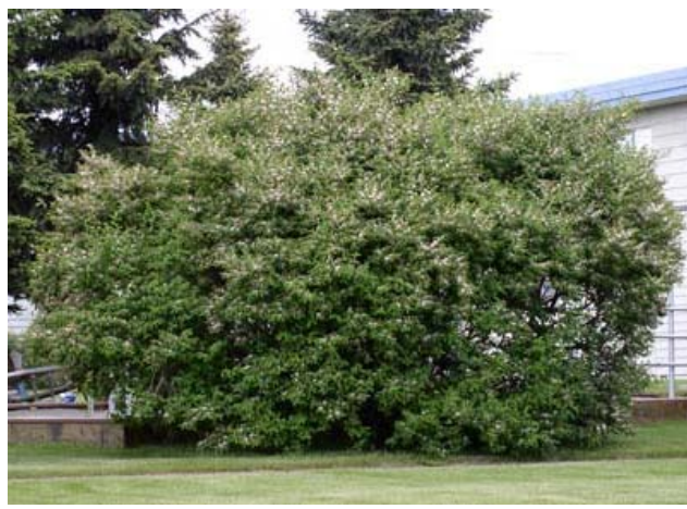
Lonicera tatarica L.

Impact on ecosystem processes: Tatarian honeysuckle can alter habitats by decreasing light availability and depleting soil moisture and nutrients (DCR 2004). It can reduce tree regeneration in early- to mid-successional forests (Batcher and Stiles 2005).