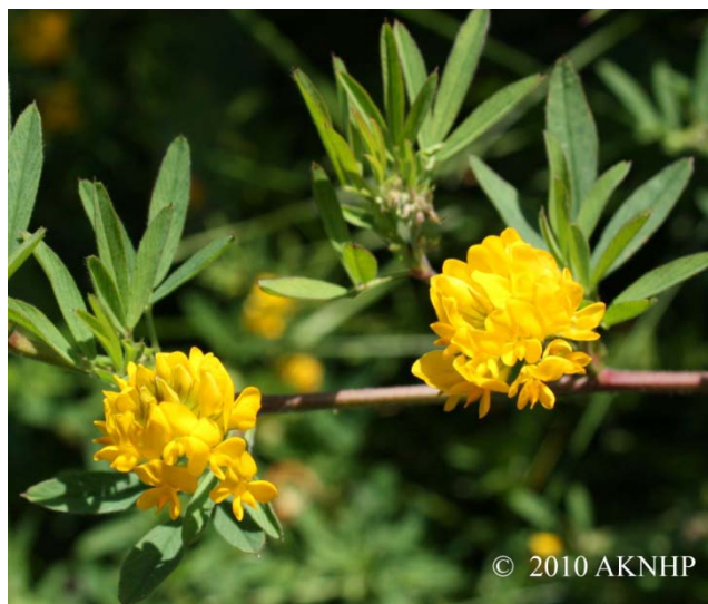
Medicago sativa ssp. falcata (L.) Arcang.

Yellow alfalfa is a perennial herb that grows up to 91 cm tall. Multiple, erect stems grow from the thick, somewhat woody crown. Leaves are alternate and composed of 3 leaflets. Leaflets are ovate, hairy, and 13 to 25 ½ mm long. Central leaflets are stalked, while lateral leaflets are sessile. Flowers are yellow and 13 mm long. They grow in oblong clusters in leaf axils. Pods are curved (falcate) or nearly straight. Each pod is 6 to 13 mm long and encloses several seeds (Hultén 1968, Hitchcock and Cronquist 1973, Royer and Dickinson 1999).