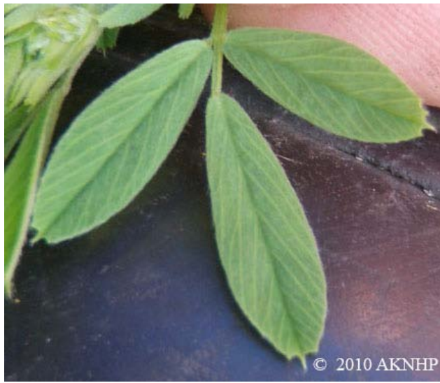
Leaves of Medicago sativa ssp. falcata (L.) Arcang.

Similar species: Yellow alfalfa readily hybridizes with common alfalfa, M. sativa ssp. sativa , to produce intermediate forms (Small and Brookes 1984). Common alfalfa can be distinguished from yellow alfalfa because it has purple flowers and spirally-coiled pods. Both alfalfa and yellow alfalfa can be easily confused with other weedy, trifoliate legumes, such as Melilotus and Trifolium species. Alfalfa can be distinguished from other trifoliate legumes, even when not in flower or fruit, by the presence of longer stalks on the central leaflets than on the lateral leaflets and toothed margins on the leaves.