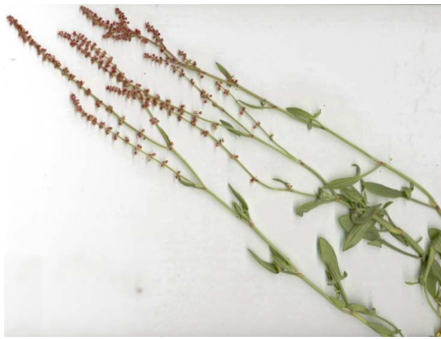
Rumex acetosella L.

Sheep sorrel is an annual or sometimes perennial herb that grows from 15 to 61 cm tall with slender, creeping rhizomes. Lower leaves are arrow-shaped with 2 conspicuous basal lobes pointing outward. Leaf blades are 1 ¼ to 7 ½ cm long. Basal leaves are long stalked. Stem leaves are more slender, sometimes lack basal lobes, and are short-stalked or sessile. Membranous sheaths surround the stems at the nodes. Leaves and stems have a sour taste. Flowers are arranged in branched, loose, leafless, terminal panicles. Each flower consists of three scale-like sepals and three petals. Male and female flowers are born on separate plants. Male flowers are orange-yellow and female flowers are red-orange. The fruits are small, three-angled, and enclosed in three persistent flower scales (Pojar and MacKinnon 1994, Whitson et al. 2000).