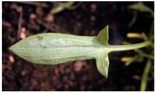
Leaf of Rumex acetosella L.

narrowly linear leaves, which sometimes lack basal lobes (Hultén 1968, FNA 1993+). The non-native garden sorrel ( R. acetosa ) has been recorded from Kodiak and Unalaska (Hultén 1968, UAM 2006). It is a stout, perennial plant that grows up to 91 cm tall. Unlike R. acetosella , R. acetosa has oblong-lanceolate leaves that grow up to 10 cm long with downward-pointing lobes. R. acetosa can be distinguished from native garden sorrel ( R. lapponicus ), which is widespread in all ecogeographic regions of Alaska (UAM 2006), by its short, broad, strongly fringed sheaths (Douglas and MacKinnon 1999).