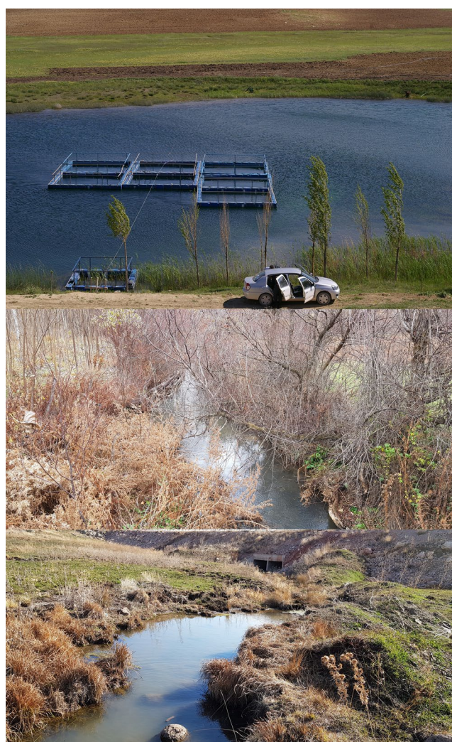
FIGURE 4 Habitats of Pseudophoxinus firati , from above: spring Yazyurdu, spring Göz, spring Karahalka

-and-conditions) on Wiley Online Library for rules of use; OA articles are governed by the applicable Creative Comm