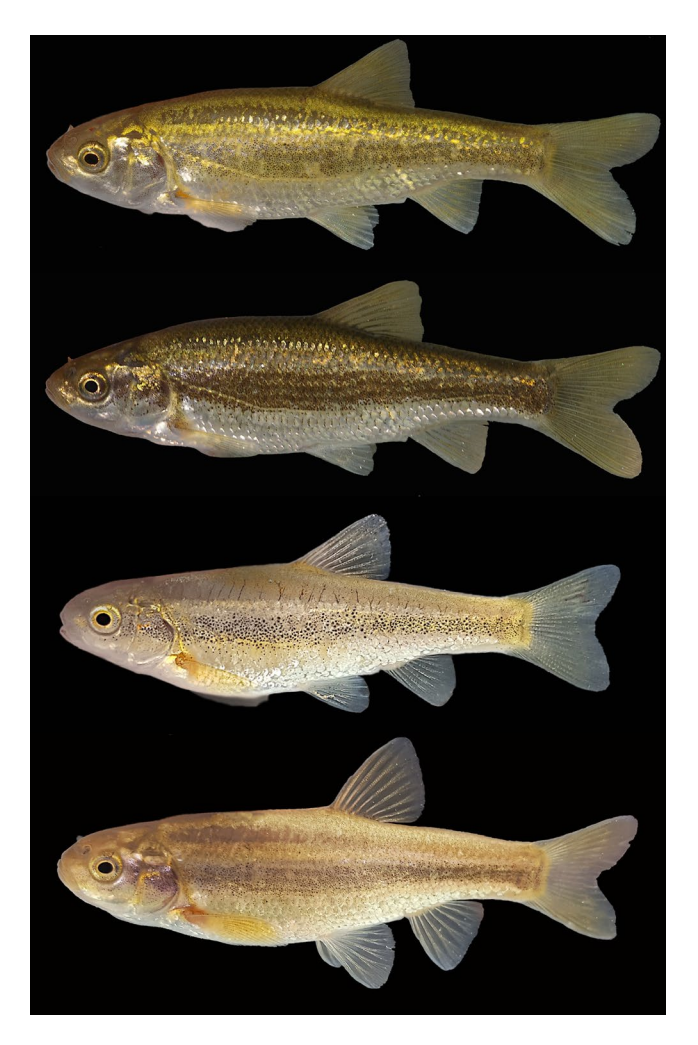
FIGURE 3 Pseudophoxinus firati, from above: male, 75 mm standard length (SL), female, 80 mm SL, spring Yazyurdu; about 40 mm SL, spring Göz; about 55 mm SL, spring Karahalka

Tohma River: The uppermost part of the Tohma River is situated just 1.5 km northeastern of the spring Yazyurdu. The Yazyurdu spring flows just one km south to the Tohma River from where P. firati was found. It is a small, shallow and clear stream with flow slowly. No pollution was observed.