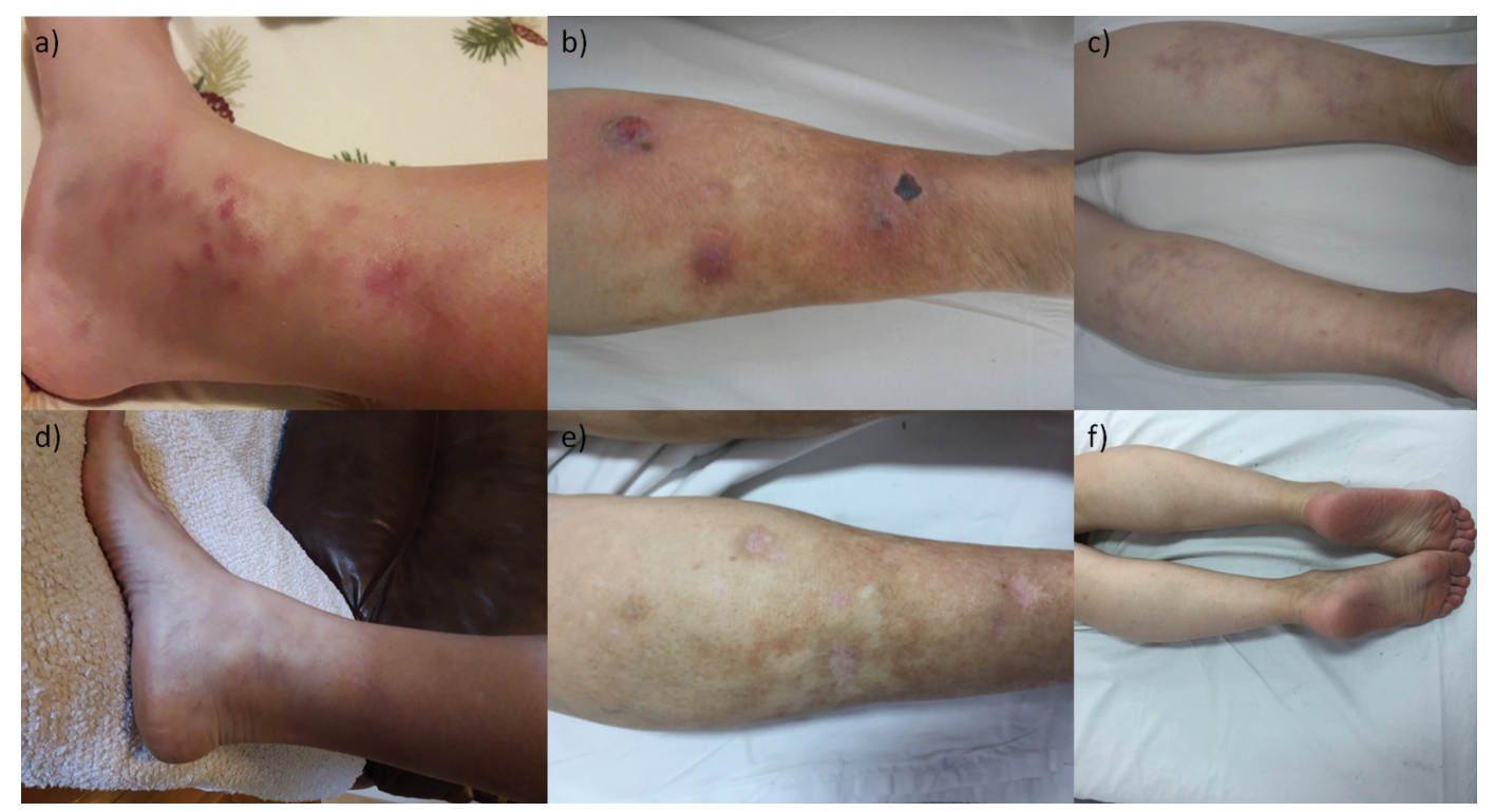
Figure 1 | (a–c) Skin lesions upon admission in Patients 1–3, respectively; (d–f) skin lesions after a follow-up at 27 months (Patient 1), 37 months (Patient 2), and 38 months (Patient 3), respectively.